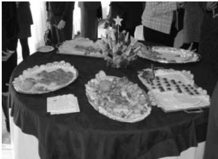
The treats were delicious at the Swiss Embassy Coffee.....