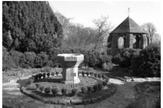
The Hortulus—Bishop's Garden

Both the Plan of St. Gall and Hortulus mention rose, iris, lily, rosemary, costmary, nigella, fennel, lovage, mint and sage. These are the fragrant flowery herbs that grow in the Hortulus Garden at Washington National Cathedral today, far away in time and place from the 9th century monks but a living remembrance of what we and they love in the garden.