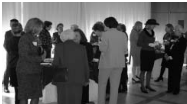
.....and everyone who attended enjoyed it all immensely.