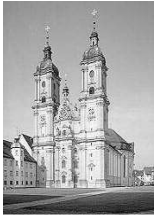
The Cathedral Church at the Convent of St. Gall