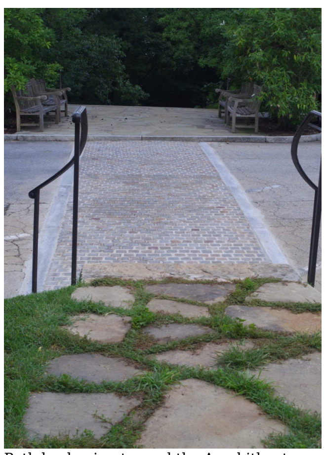
Path beckoning toward the Amphitheater

A long-awaited piece of the Cathedral Close landscape has just been completed. It has been either 100 years or only ten years in the making, but either way we are so very pleased. A stone crossing of Pilgrim Road linking the Bishop's Garden and its south lawn with the All Hallows Amphitheater and the adjacent Olmsted Woods feels like a finishing touch to the Amphitheater, completed in 2008. The Amphitheater was the capstone of the ten-year project that rescued the Woods from invasive species, tree decline and soil compaction, and corrected erosion using innovative water control and filtering. These efforts continue through the efforts of the Guild. An Amphitheater was on early plans of the close as envisioned by Frederick Law Olmsted, Jr., but the reality for a century was simply a natural