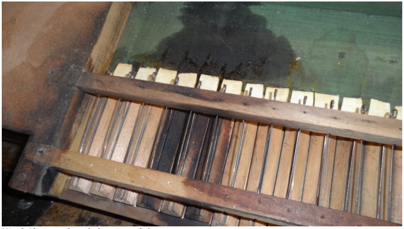
Wind Chest as found showing oil damage