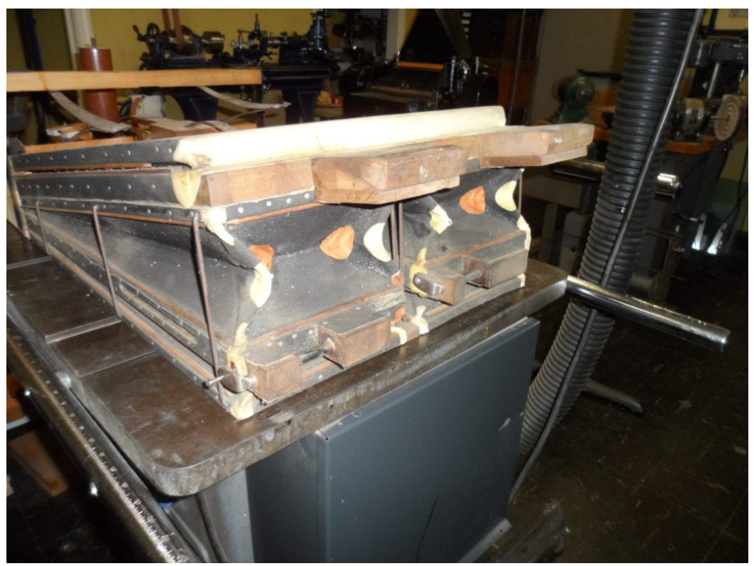
Pressure pump as found

Following Flower Mart 2019, the caliola and its case were moved to Baltimore for overhaul. The organ is played with a complex system of pumps, bellows, and pipes. Mr. Center completely dismantled the organ in order to releather the pressure pump, the pallet valves and gaskets of the windchest, and the loose stoppers of the brass pipes.