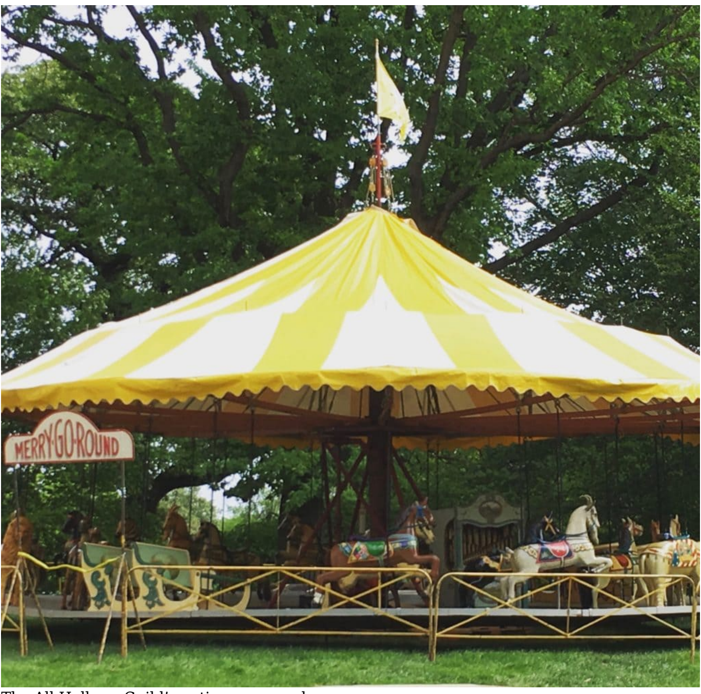
The All Hallows Guild's antique carousel