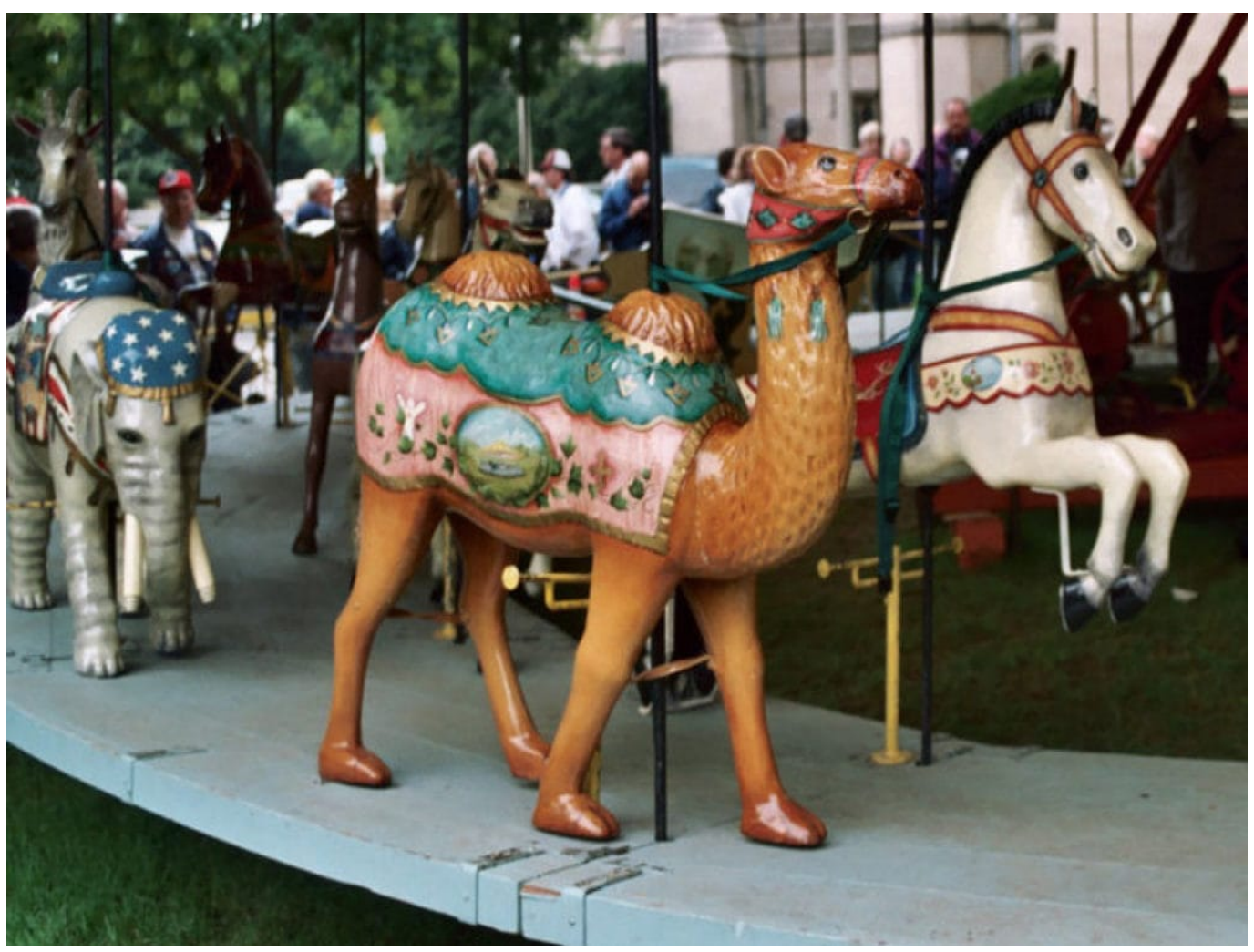
Pillow the Camel