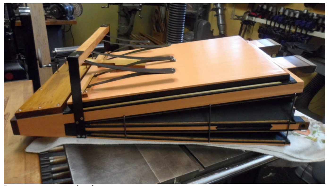
Pressure pump completed