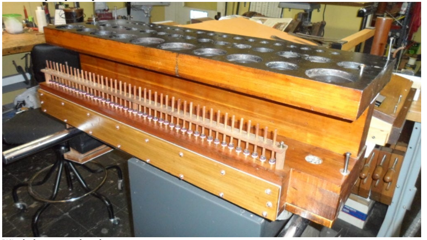
Wind chest completed