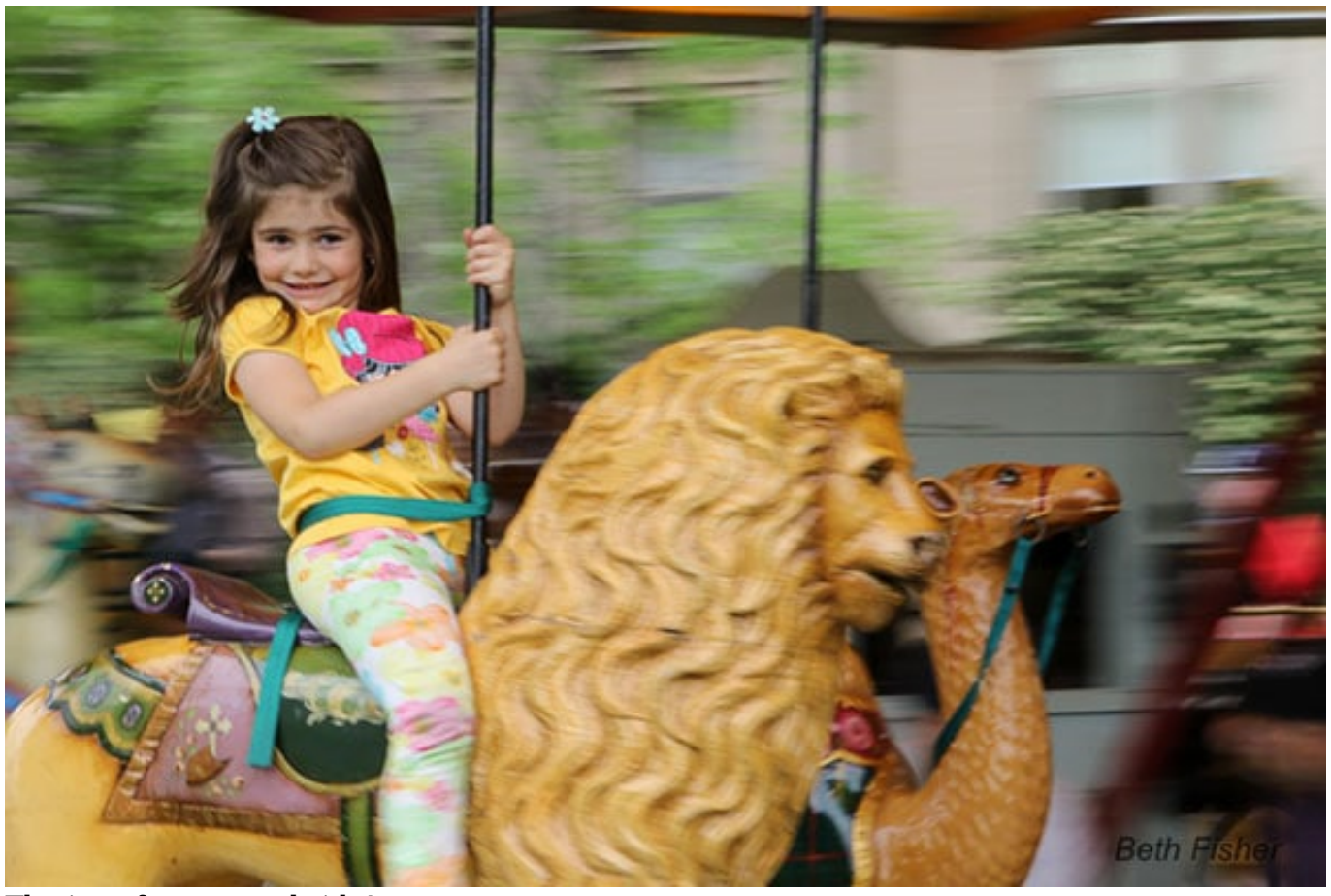
The joy of a carousel ride!