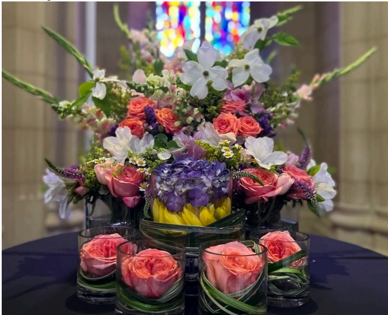
France - 2022