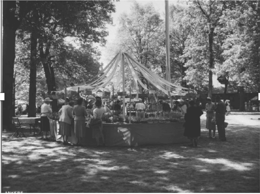
AHG Plant Sale - 1952

And today, Premier Plants has vastly expanded its space and the selection of plants.