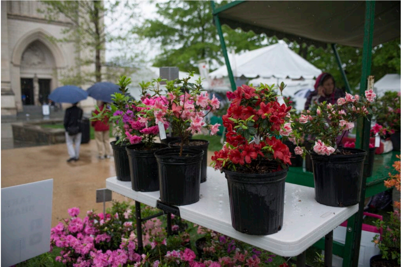
Flower Mart at Washington National Cathedral