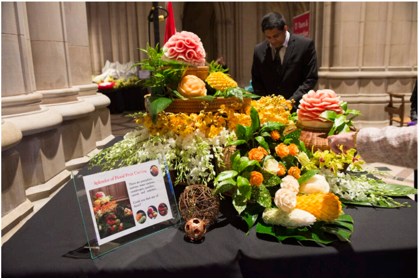
The Embassy of Thailand creates a floral display out of fruit in 2016

Cathedral nave. Special lighting enhances each exhibit. Delivering and installing the arrangements takes much time and attention to detail. In 2016, The Embassy of Thailand featured a fruit floral display with an exhibition of how each fruit was cut to resemble a flower.