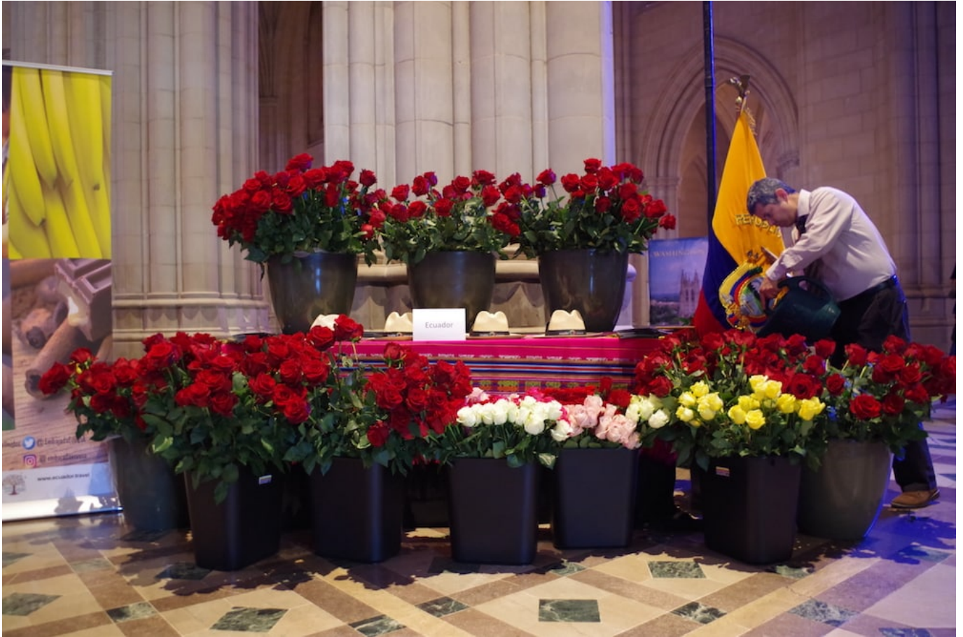
Ecuador - 2019