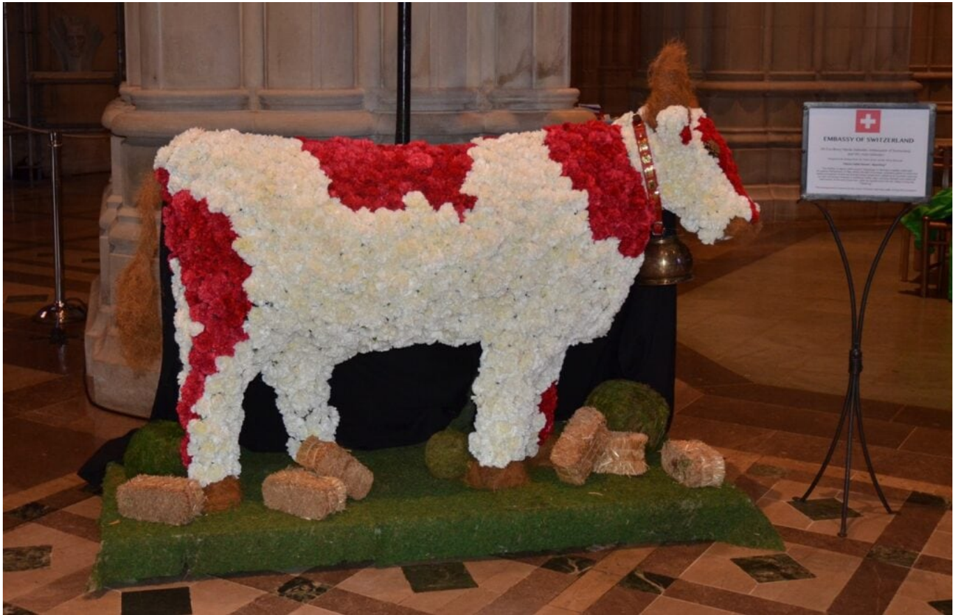
Embassy of Switzerland - 2019