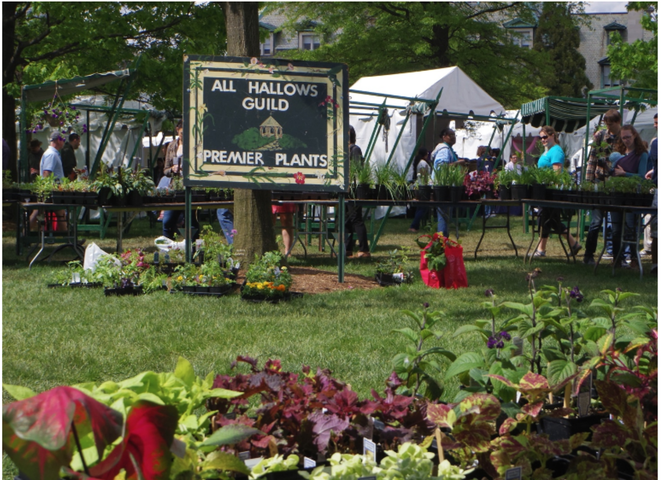
Premier Plants in the 21st Century

In addition to our Premier Plants, you will find a variety of vendors selling plants and garden supplies at Flower Mart.