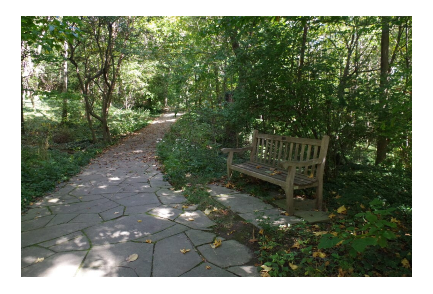
August 28, 2023