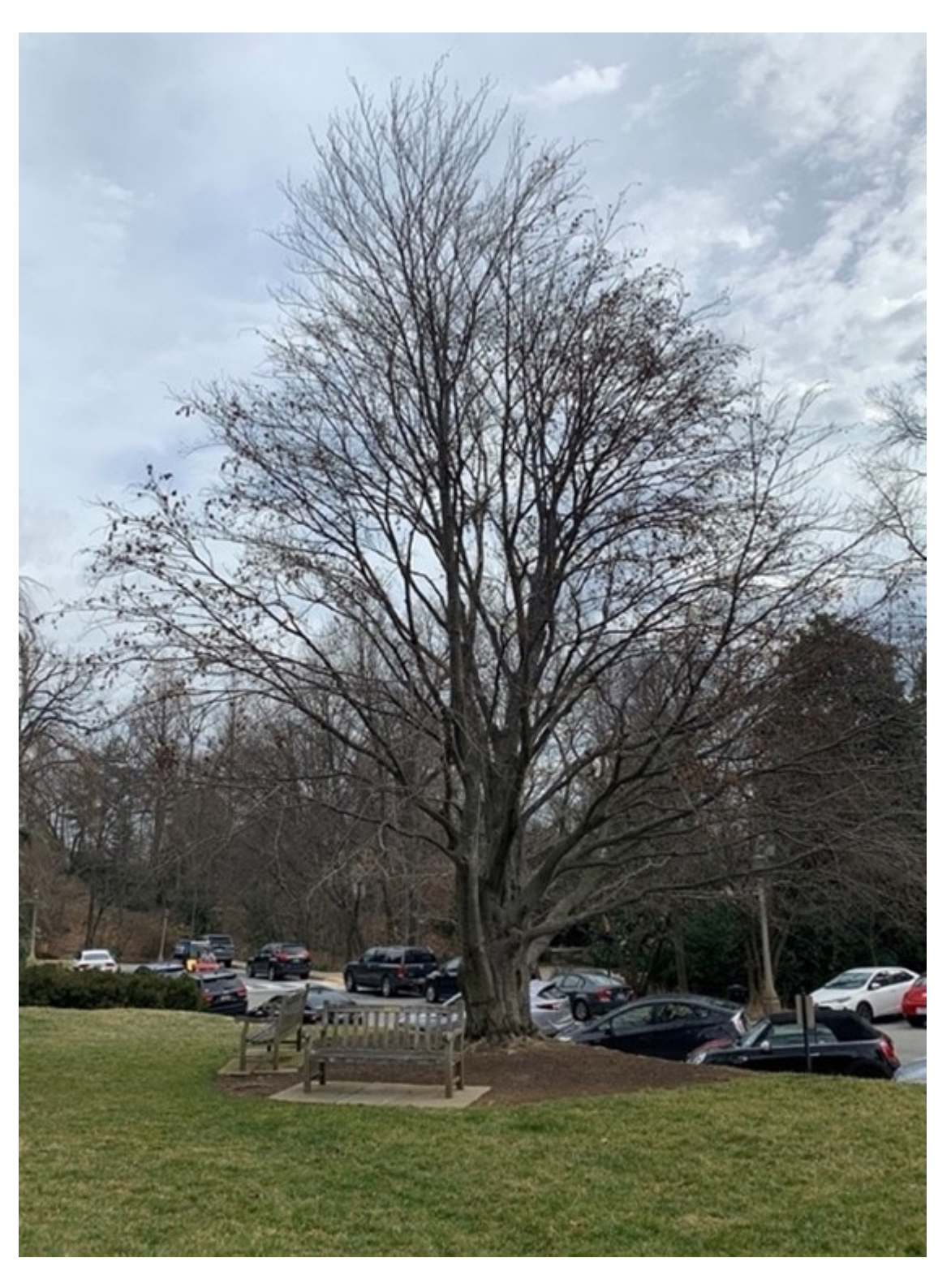
The Copper Beech, also known as a Purple Beech, is a cultivated form of the common Beech.