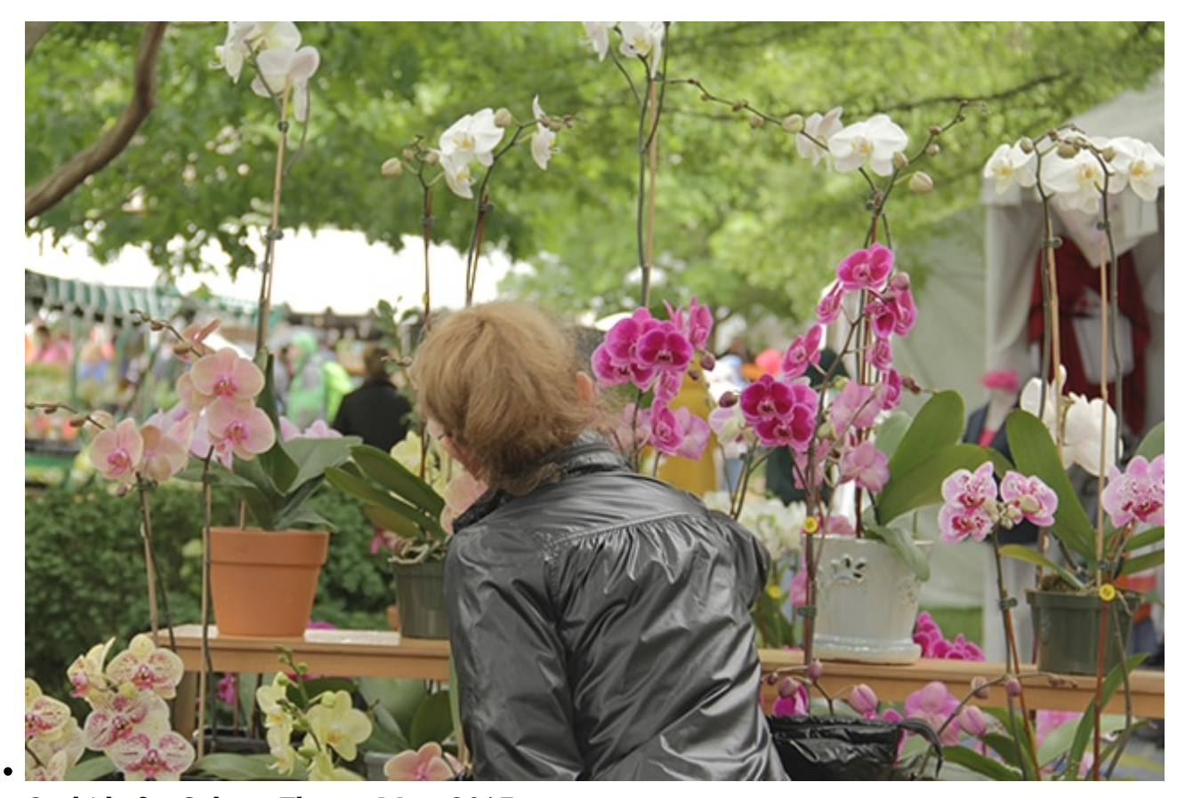
Orchids for Sale at Flower Mart 2017