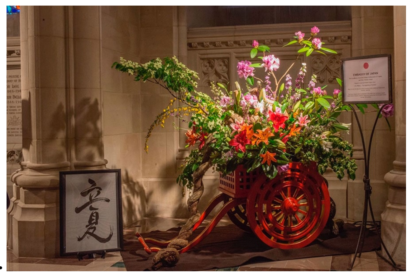
International Floral Display