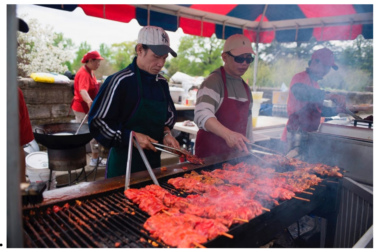
Flower Mart Festival Foods