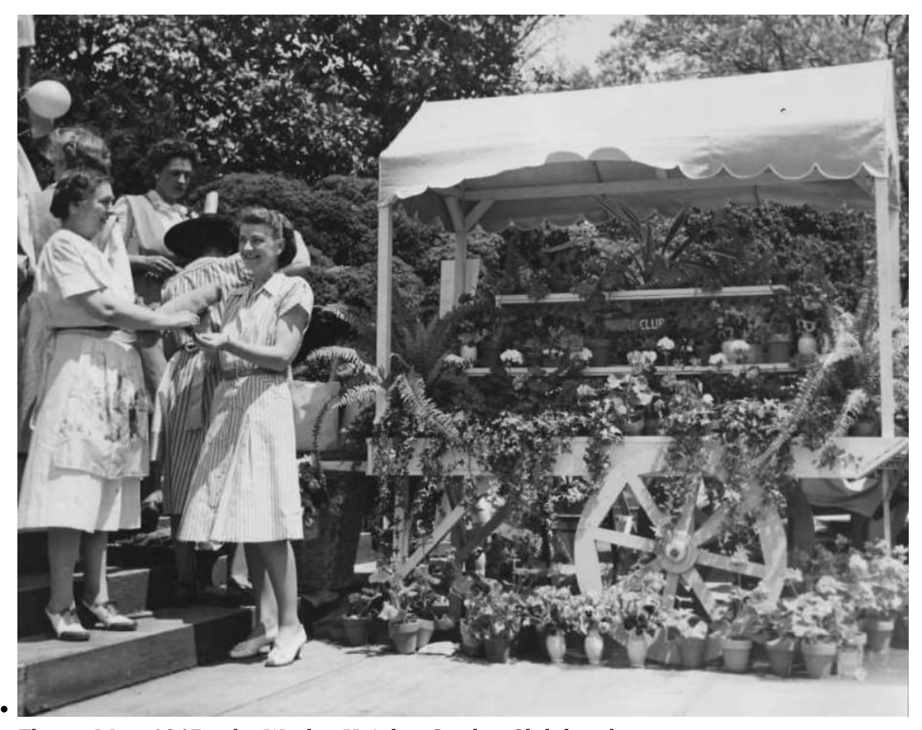
Flower Mart 1947 - the Wesley Heights Garden Club booth