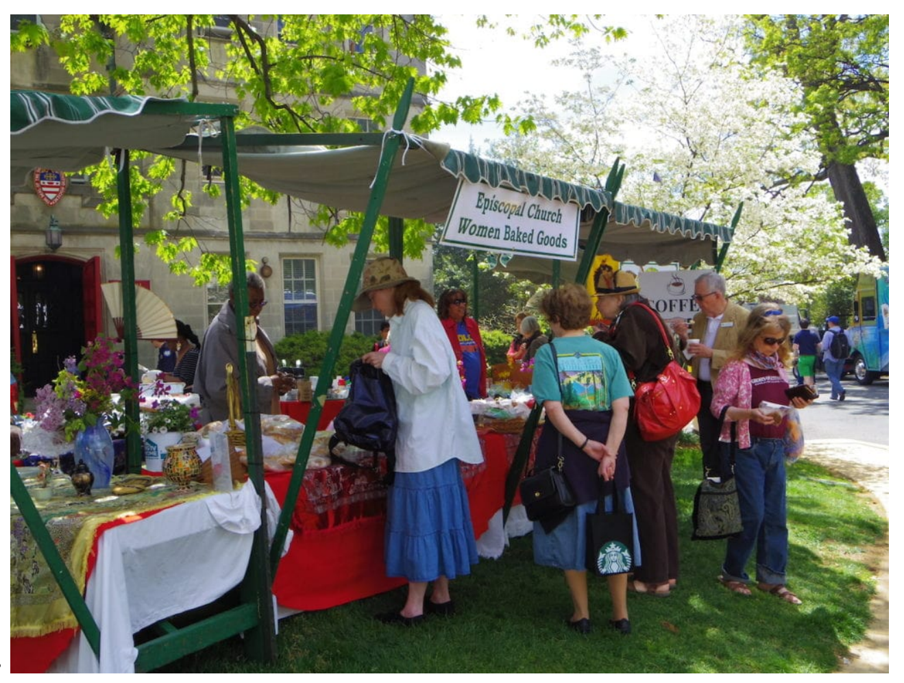
Episcopal Church Women's Baked Good Tent