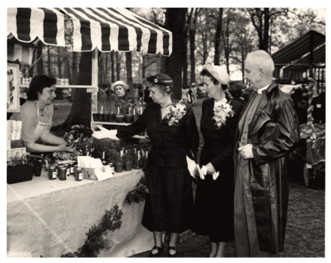
First Lady Bess Truman shopping at Flower Mart in 1950