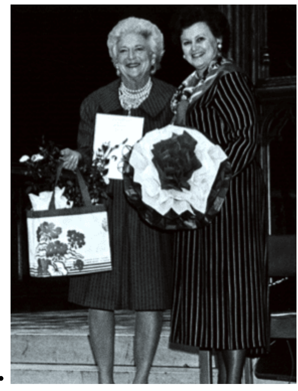
Barbara Bush at Flower Mart 1990

Flower Mart has honored the United States and the District of Columbia a number of times with themes such as the Bicentennial of Washington, DC, in 1991 and the Bicentennial of the United States in 1976.