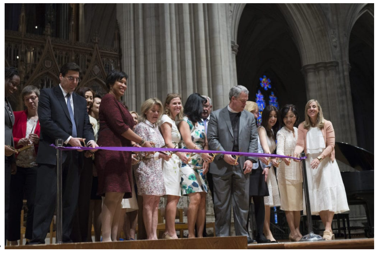
DC Mayor Muriel Bowser Helps Open Flower Mart 2018