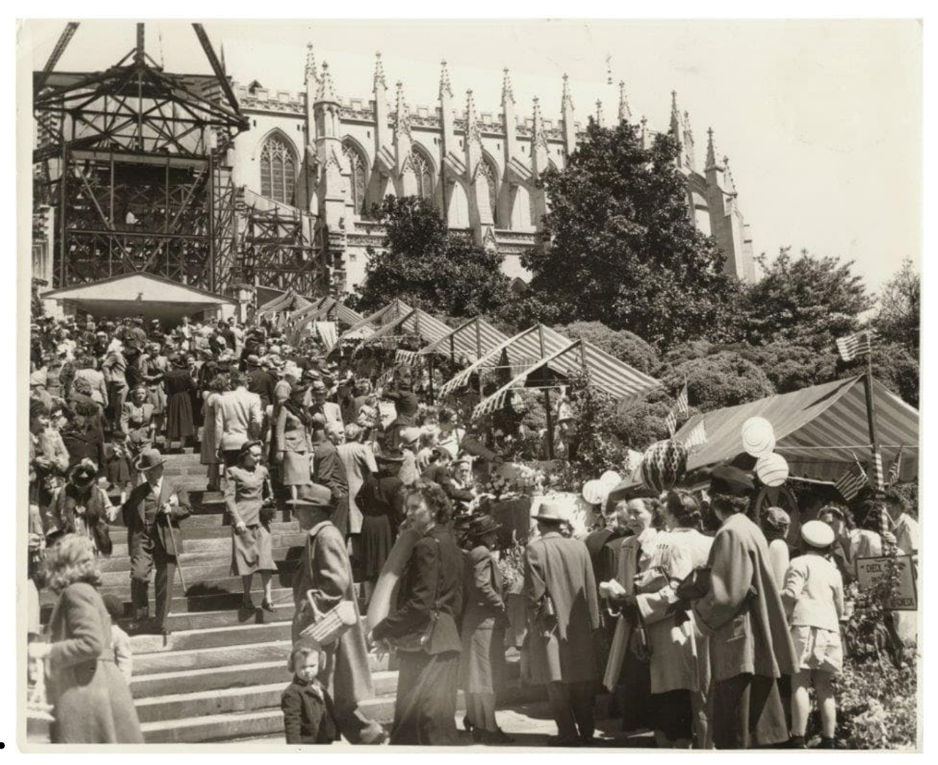
Flower Mart 1948 on the Pilgrim Steps