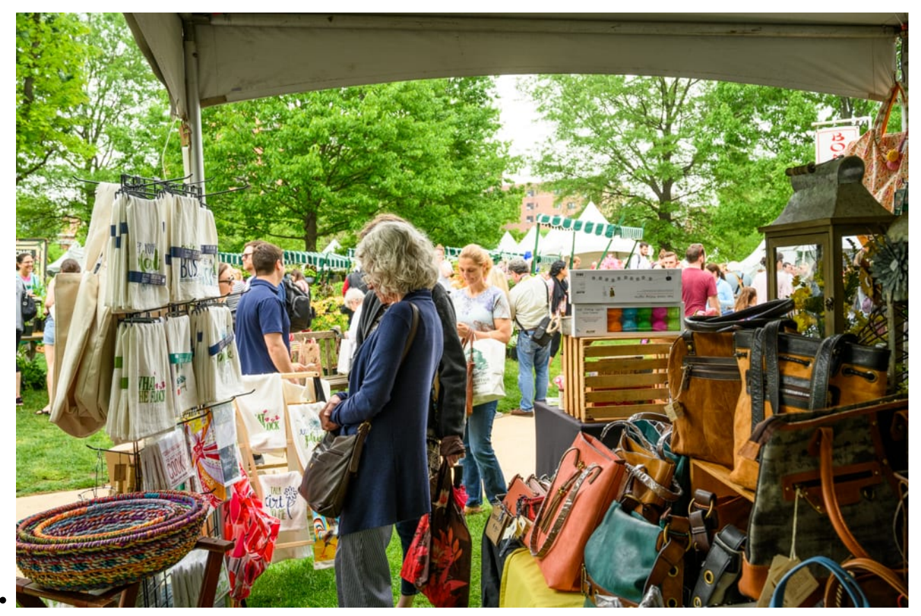
Shoppers at Flower Mart 2019