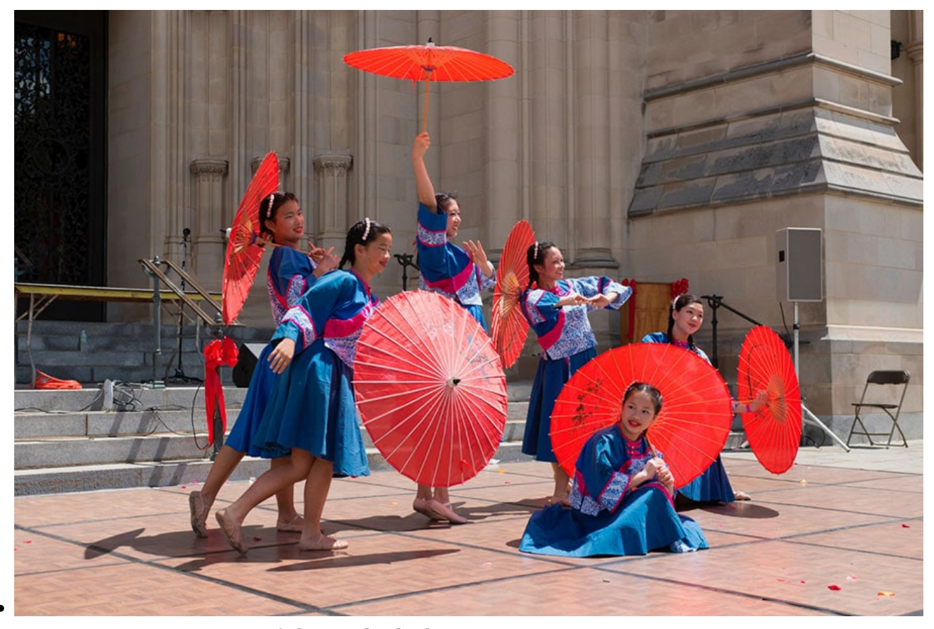
Entertainment in Front of the Cathedral