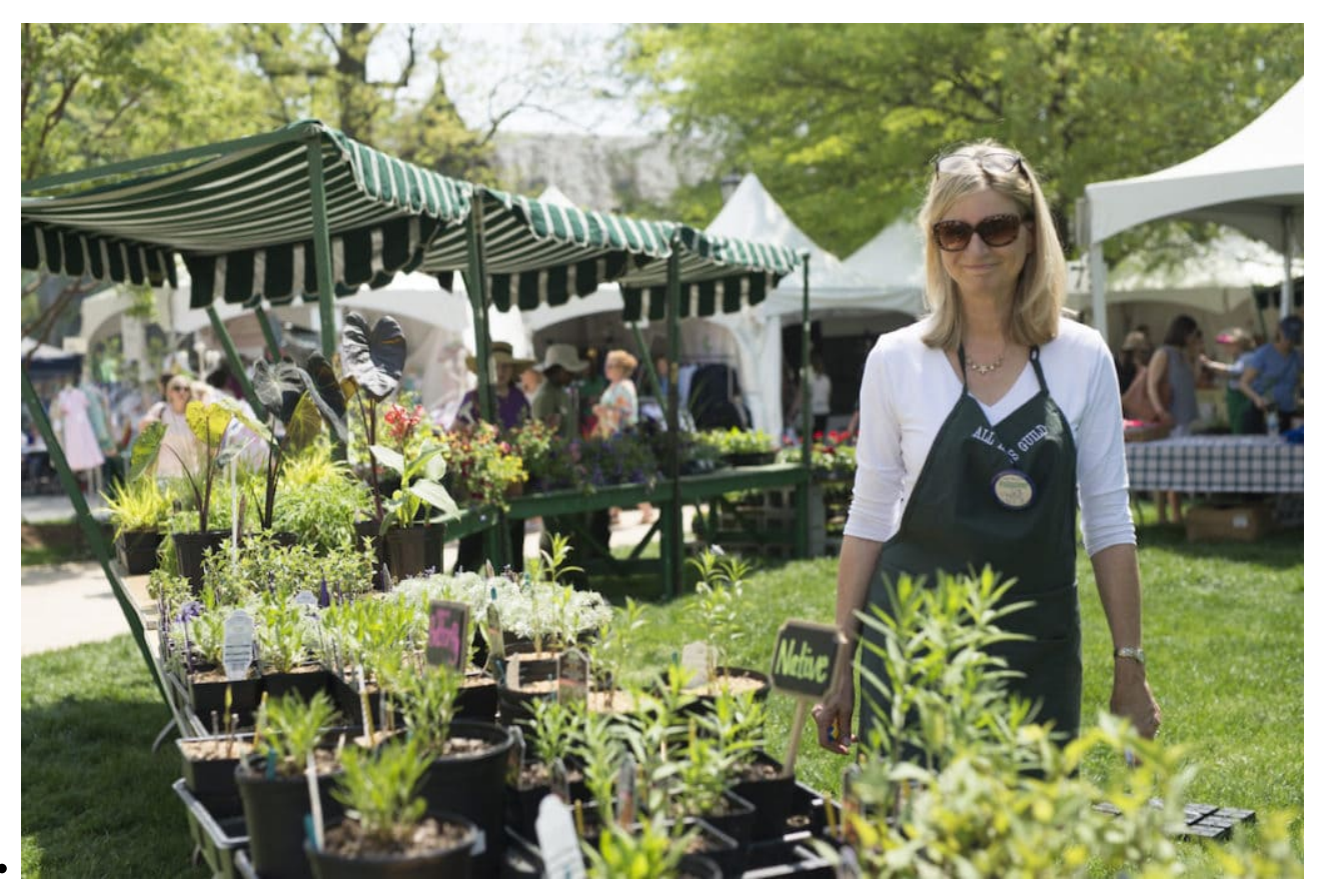
Premier Plants at Flower Mart 2018