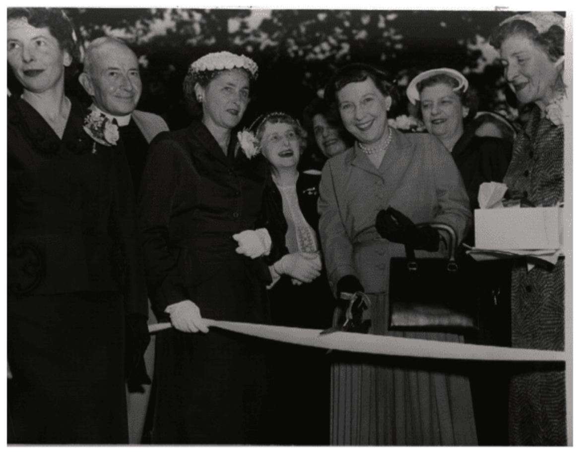
Mamie Eisenhower opening Flower Mart in 1953

Eight First Ladies have opened or attended Flower Mart – several were "Second Ladies" at the time they attended: