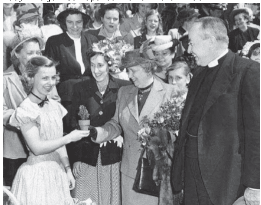
Bess Truman at Flower Mart 1948