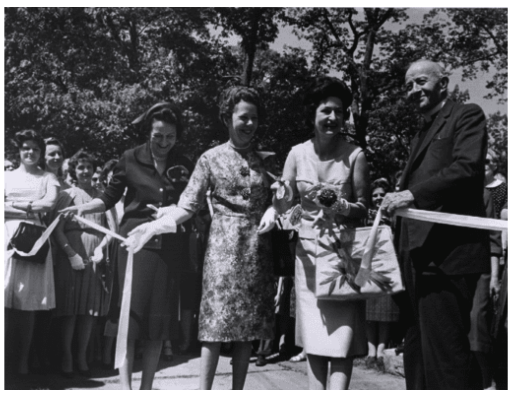
Lady Bird Johnson opened Flower Mart in 1962