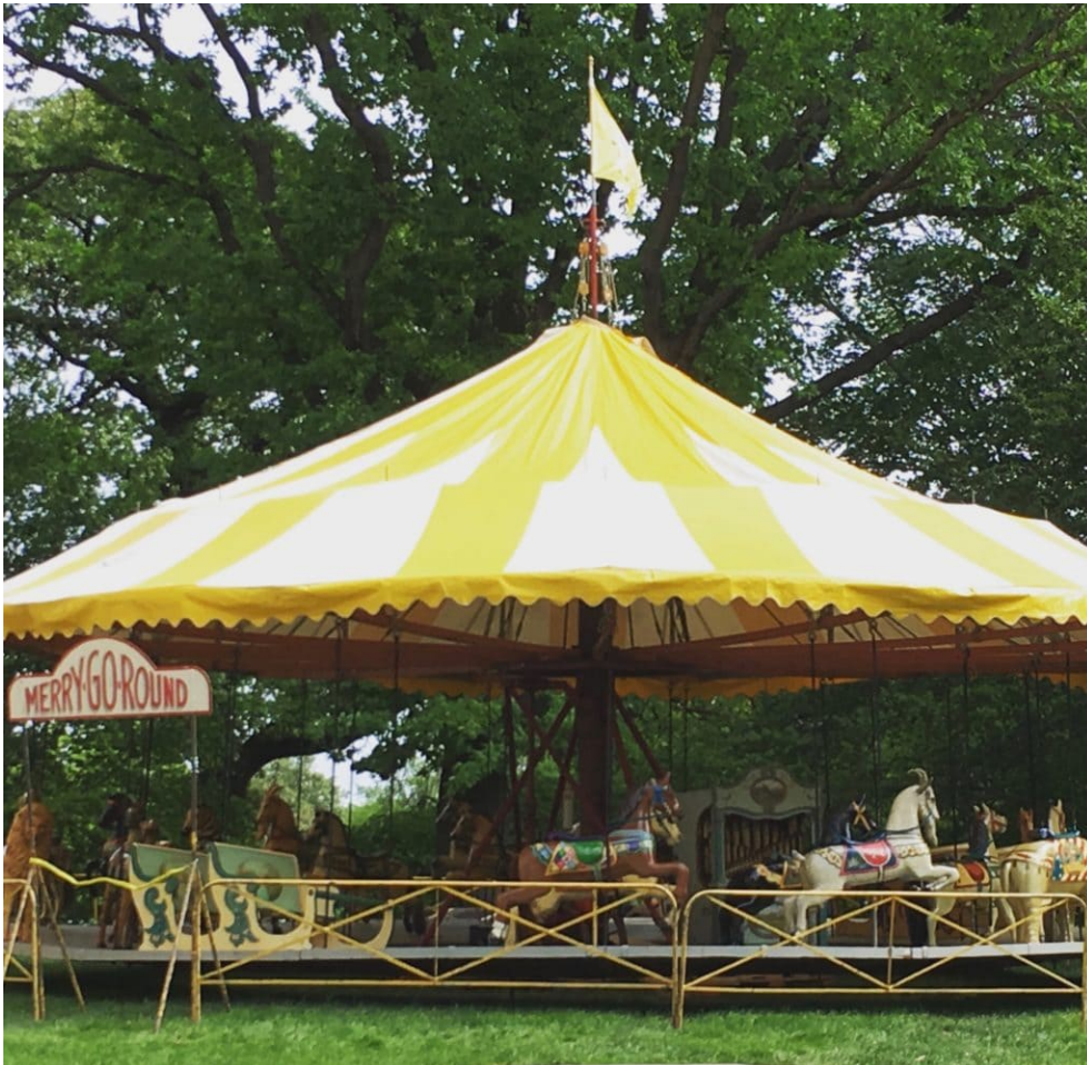
The All Hallows Guild's antique carousel

Since 1963 All Hallows Guild has owned the historic traveling carousel (circa 1890) that appears each year at Flower Mart.