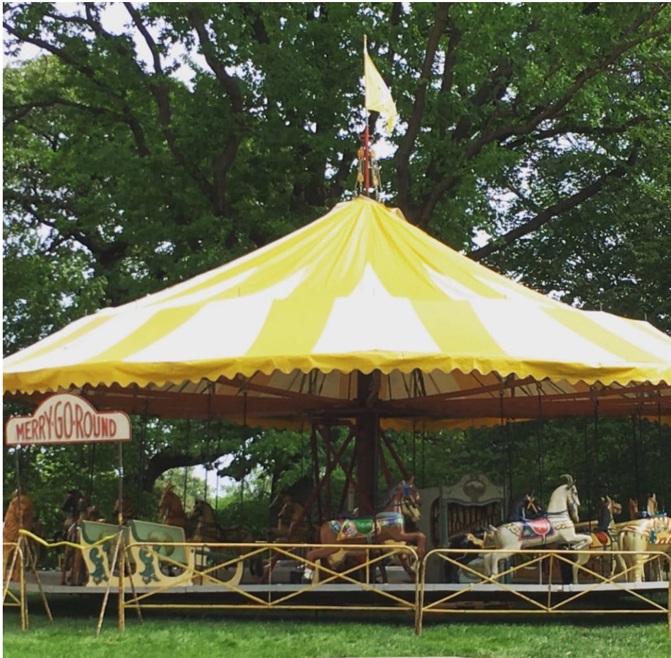
The All Hallows Guild's antique carousel

Since 1963 All Hallows Guild has owned the historic traveling carousel (circa 1890) that appears each year at Flower Mart.