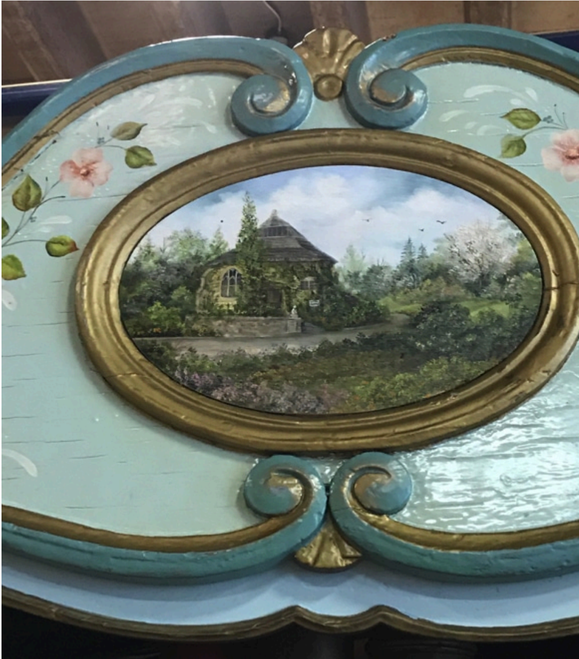
A painting of the Baptistry building adorns the top of the caliola cover