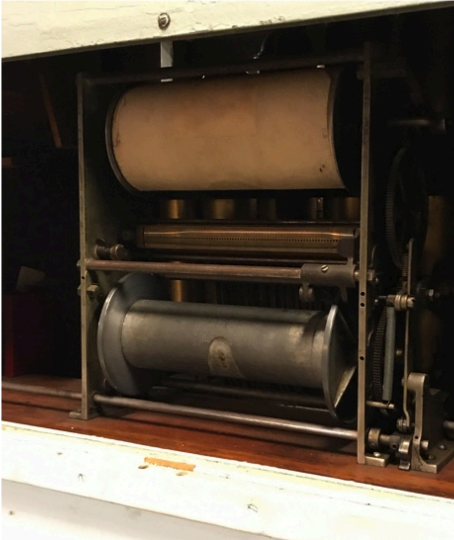
One of several music rolls