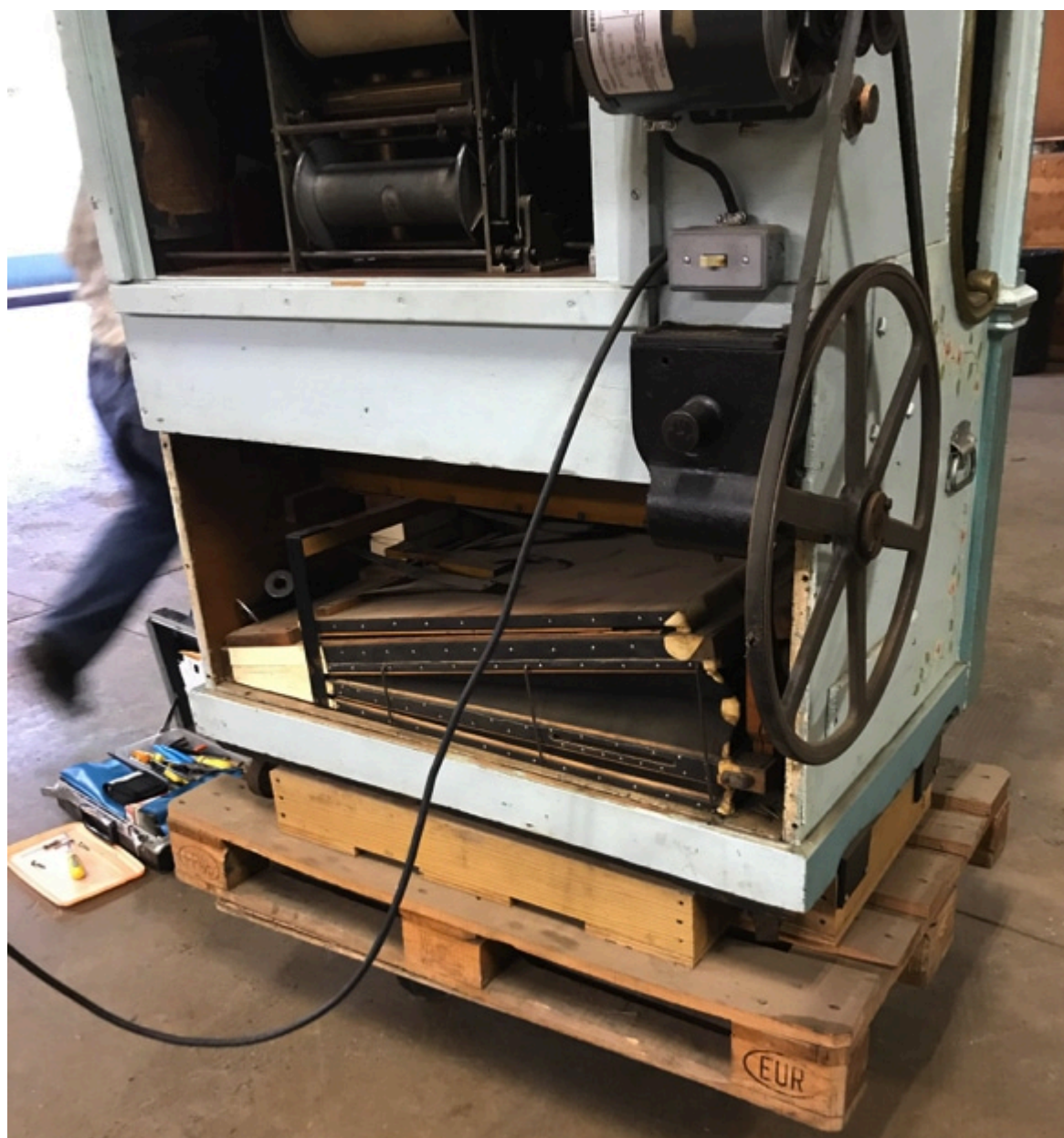
The caliola bellows