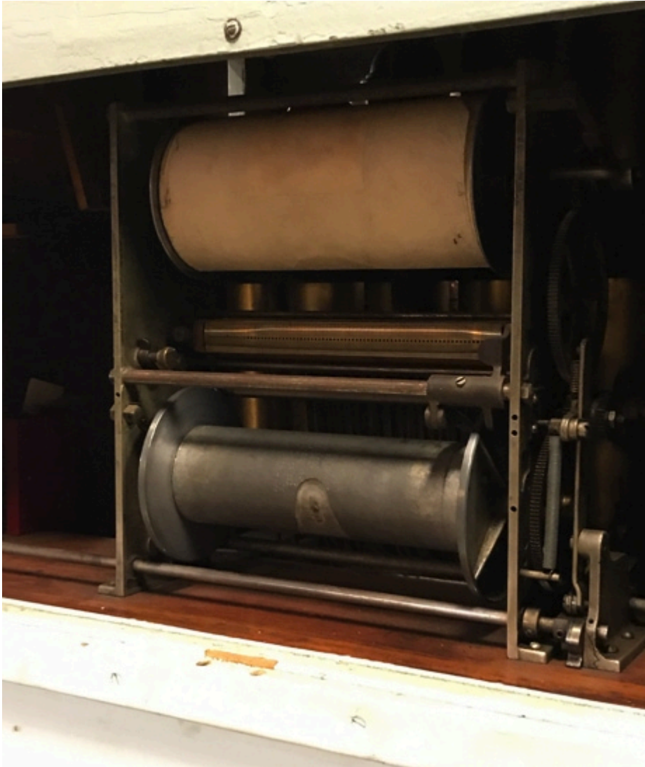
One of several music rolls