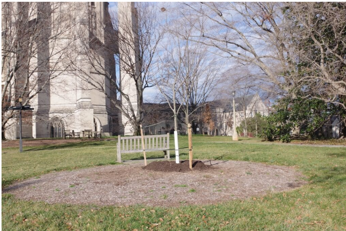
Young trees have been planted between the Cathedral Apse and the Cathedral Library