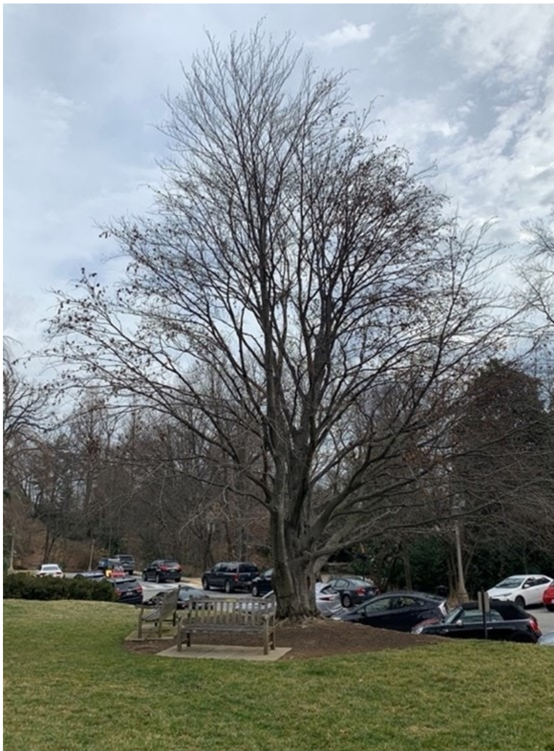
The Copper Beech, also known as a Purple Beech, is a cultivated form of the common Beech.