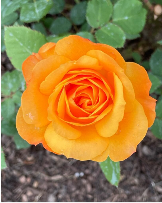
A rose from the Bishop's Garden

of the playing fields. That landscape is 7 acres, and it needs to be kept nice because it faces all the neighbors.