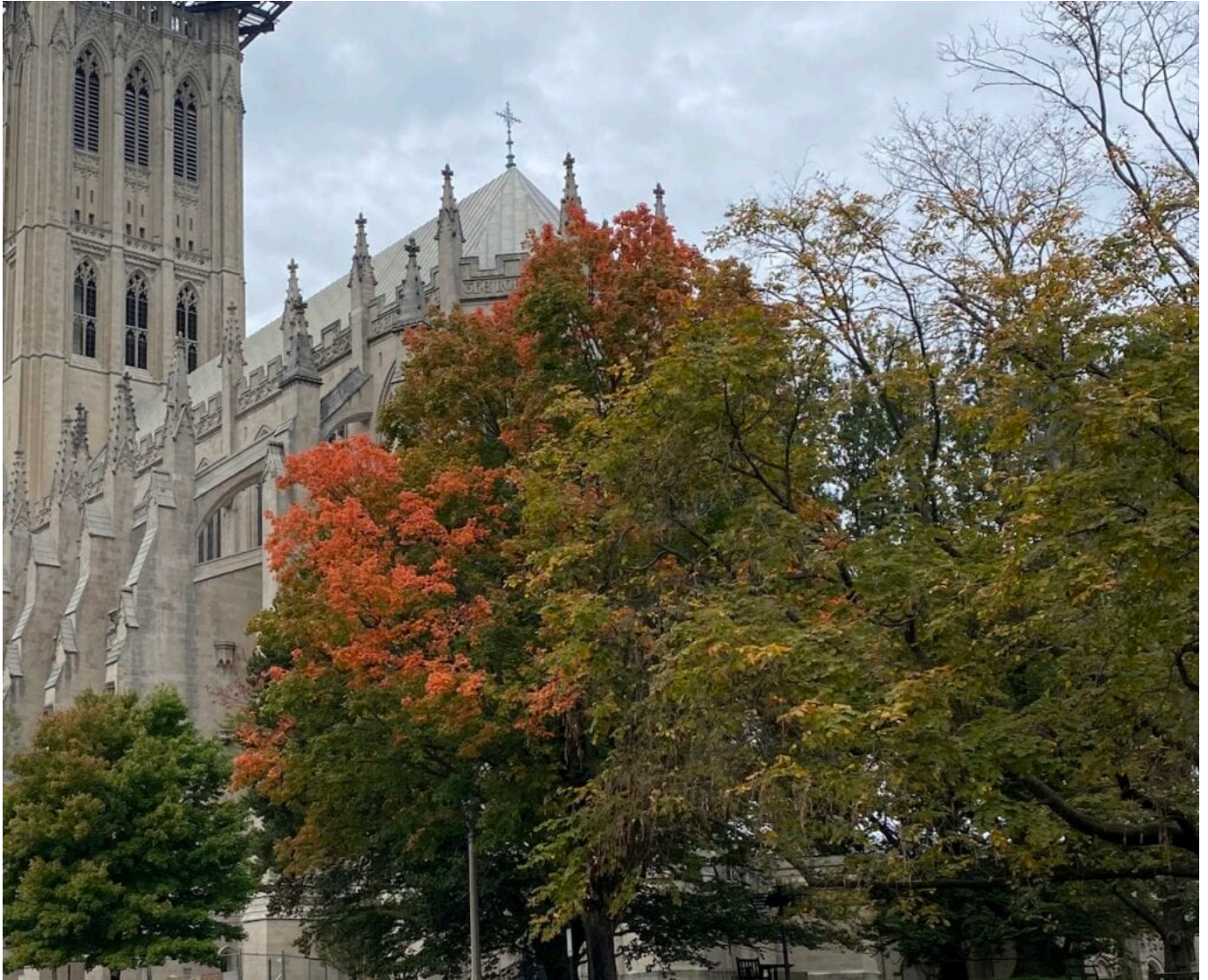
Autumn 2019 – the area behind the Cathedral Apse was shaded by large oak and beech trees

The newly planted trees are stage one of a redesign of the entire area – which we hope will incorporate seating areas, paths, and plantings. The current layout forces people wishing to use the tables and benches to walk through the plantings – creating soil compression as well as trampling the flowers. Our hope is to create an inviting space where nature and humans can coexist harmoniously.