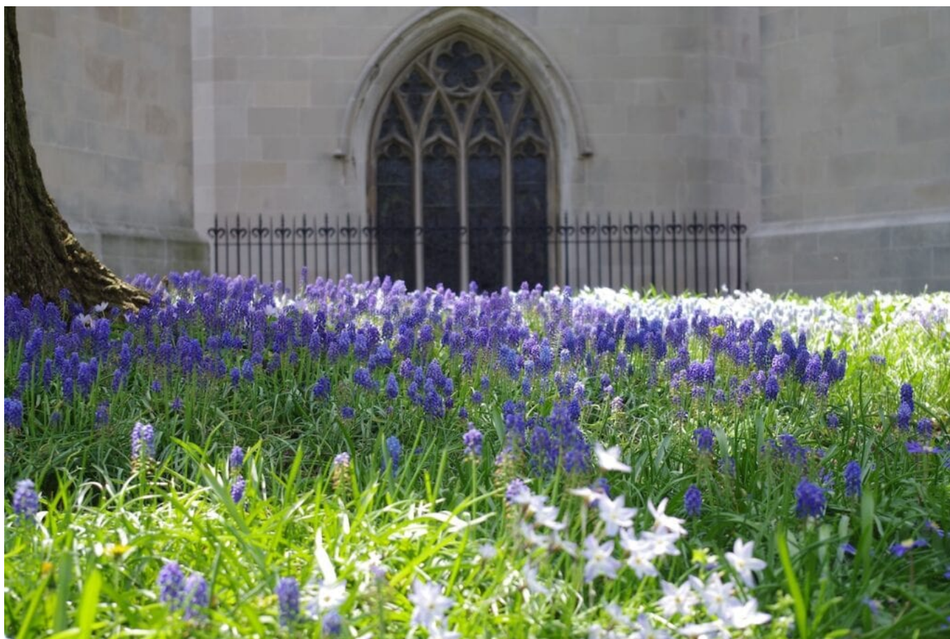
Mascara and Chionodoxa forbesii bloom in the apse area in early spring

Eventually, the new trees will be underplanted with native plants to define where the turf ends and the garden bed begins. The grove is being planned to provide spaces for people alone or in small groups to relax, meditate, or converse.