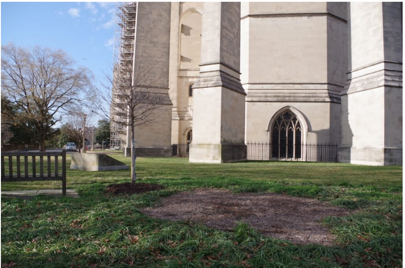
Young oak tree planted adjacent to the former location of a large tree

There are nearly 60 oaks native to the United States , with some native to very small ranges that illustrate just how diverse the genus Quercus truly is. Oaks can be found presiding over pastures, providing shade in urban parks and suburban neighborhoods, and thriving in natural stands in the United States and Canada. The White Oak is the state tree of Maryland.