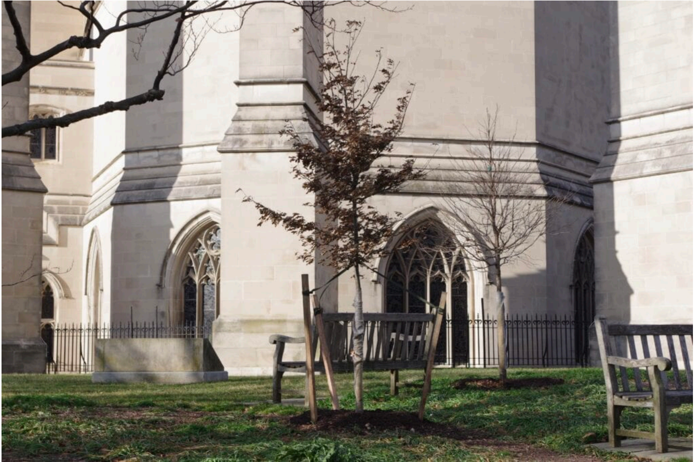
Bench near young tree - December 2023