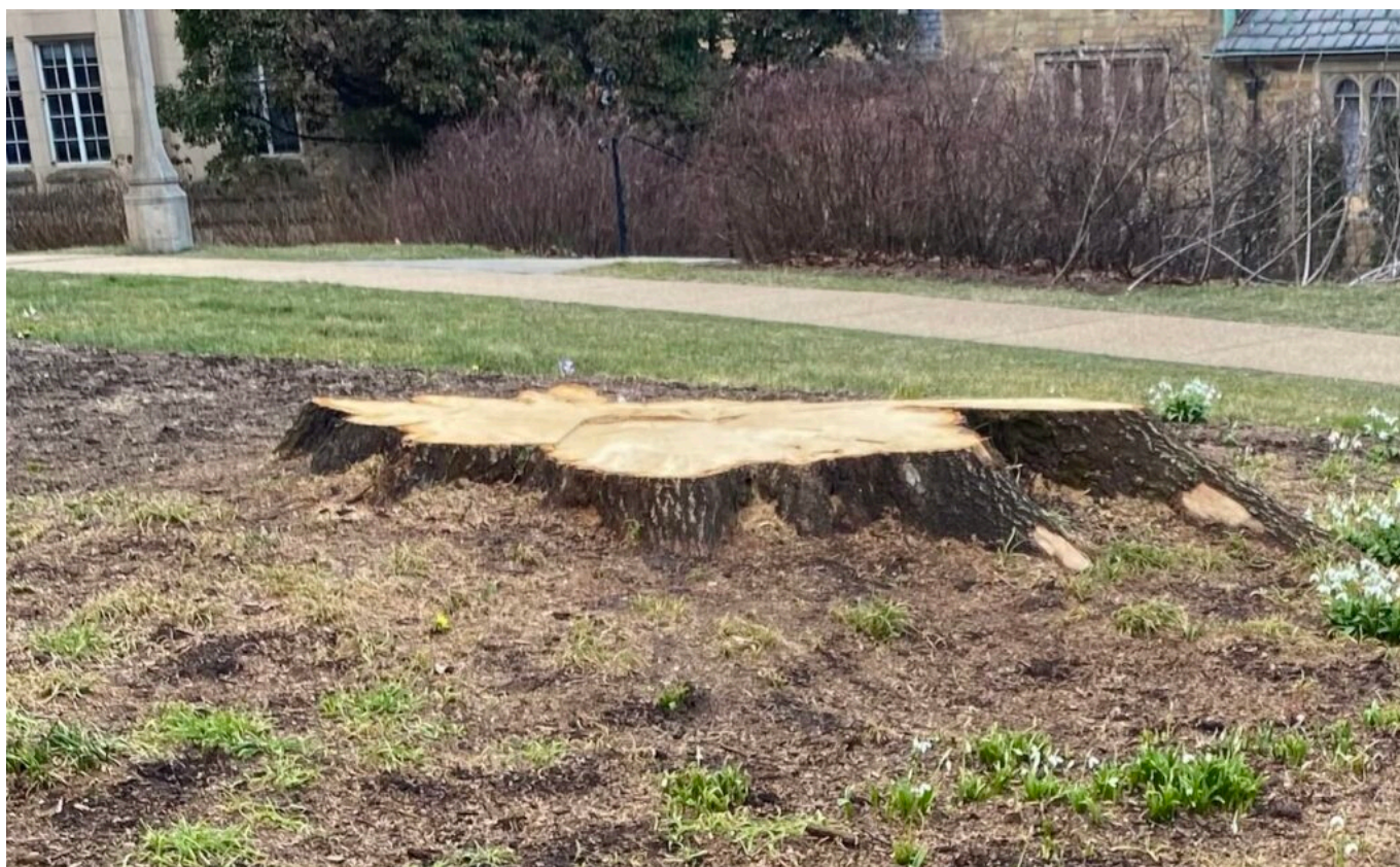
Remains of a tree removed near the Apse