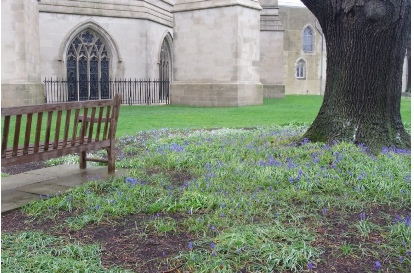
Bench near mature tree – Spring 2021