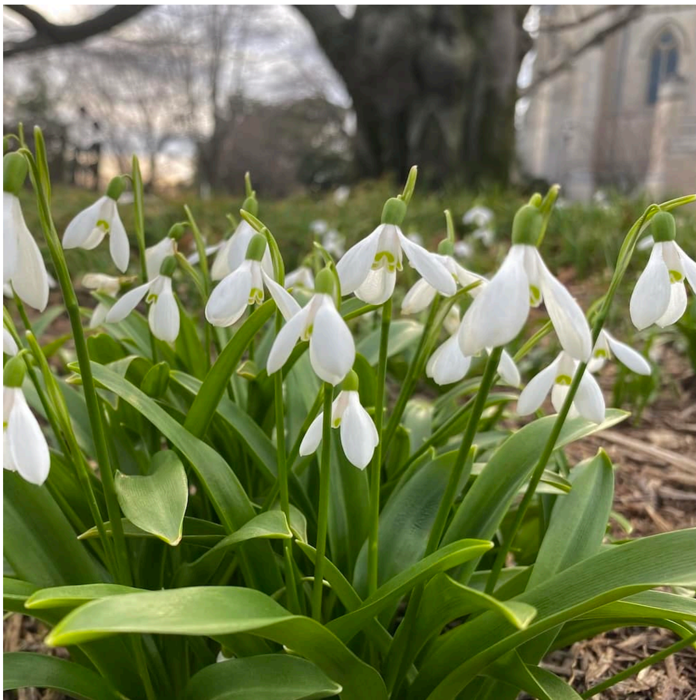
Galanthus are the first to bloom in the apse area - often in January