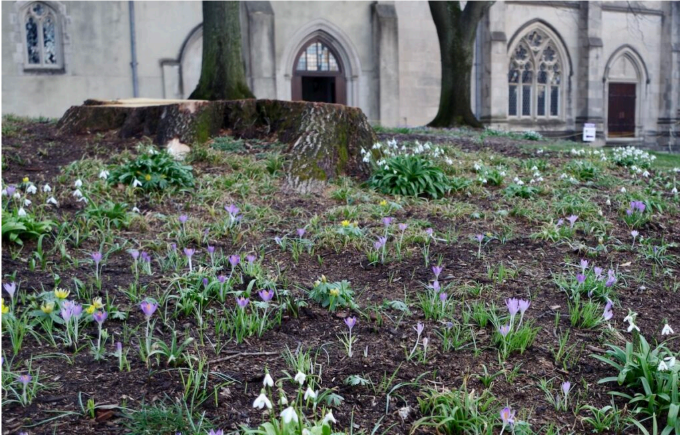
The stump of a large oak – February 2023

Oak trees are slow-medium growing trees that reach mature heights of 50 to 80 feet. Under optimal conditions they can have lifespans of up to 500 years. In order to give these new trees their best chance to reach maturity, three varieties were selected: overcup oak, Quercus lyrata ; shumard Oak, Quercus shumardii ; and swamp chestnut oak, Quercus Michauxii .