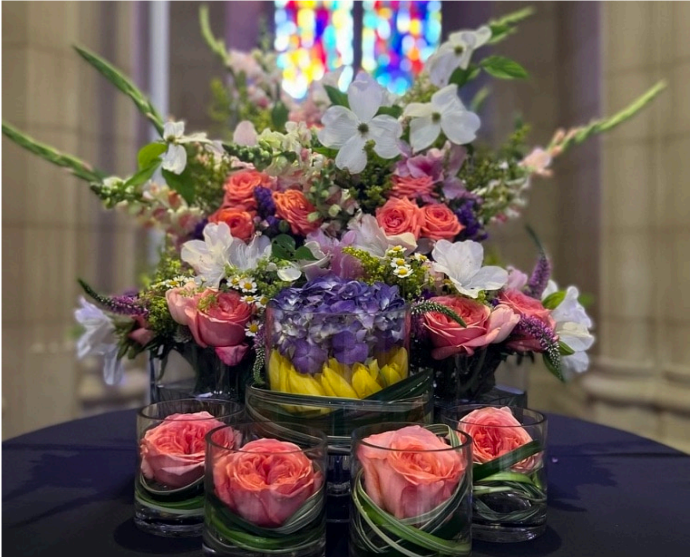
France - 2022