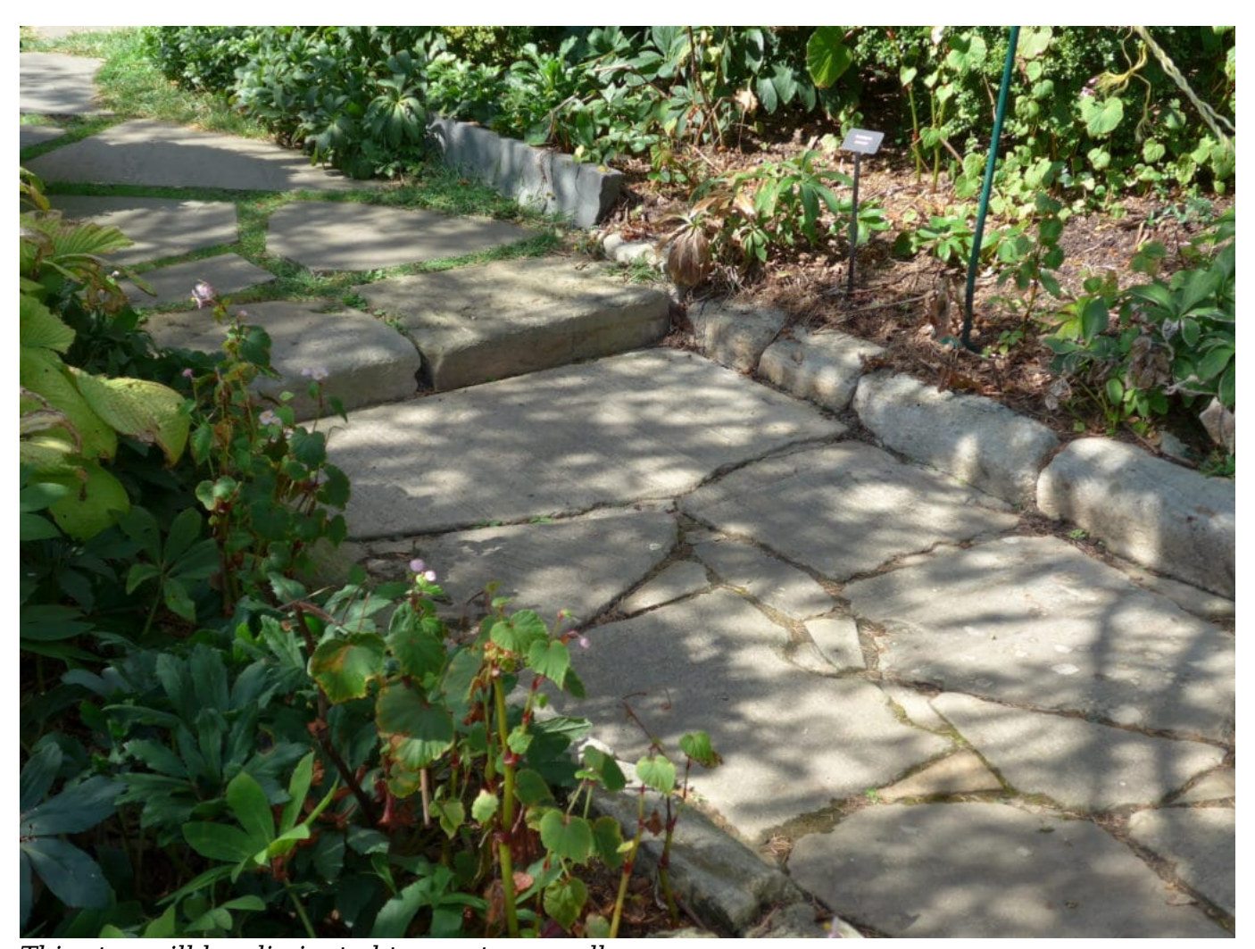
This step will be eliminated to create a small ramp

There is currently access for a wheelchair on the driveway behind the Baptistery (café), opening onto the Bishop's Lawn. At an entry to the garden proper where there is only one step (below) we will raise the level of the sidewalk to create a small ramp; using this a wheelchair could be pushed around for viewing nearly the entire garden.