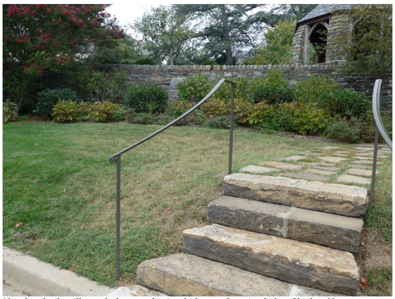
New handrails will match these at the Amphitheater Crossing below Shadow House

These modifications will be performed in the next month to provide greater security for all our guests, especially with the approach of wet and snowy weather. We do welcome all visitors and want to provide greater comfort and safety as you view these magnificent gardens.