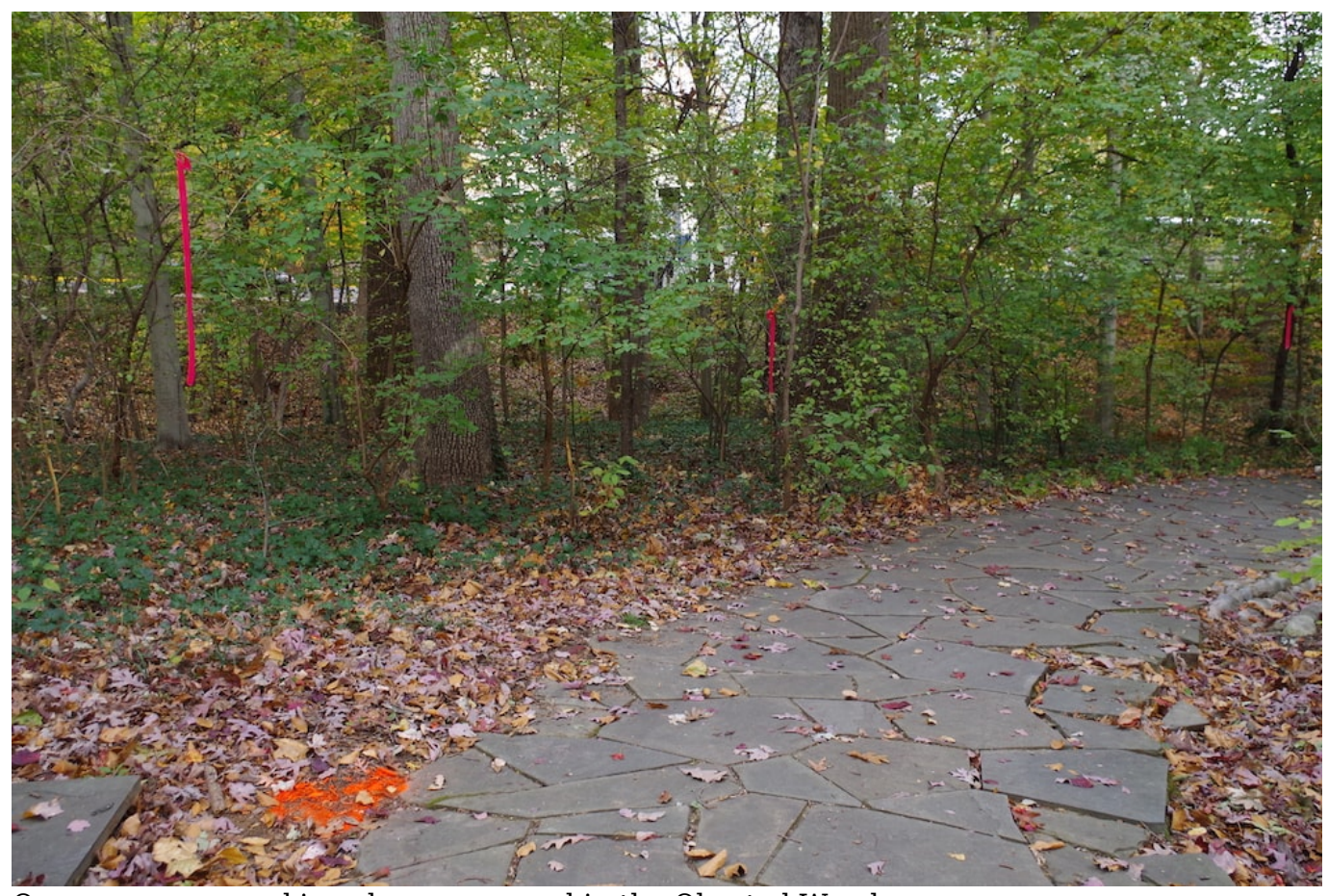
Orange survey markings have appeared in the Olmsted Woods

Have you noticed orange survey markers in the Olmsted Woods? Lovers of the Woods have been concerned that they indicate a plan to build on this dedicated five-acre urban forest. Quite the contrary! All Hallows Guild's 1998-2008 project of Woods preservation and erosion control was successful in addressing water runoff, soil compaction, and tree degradation, but it must be a continuing effort.