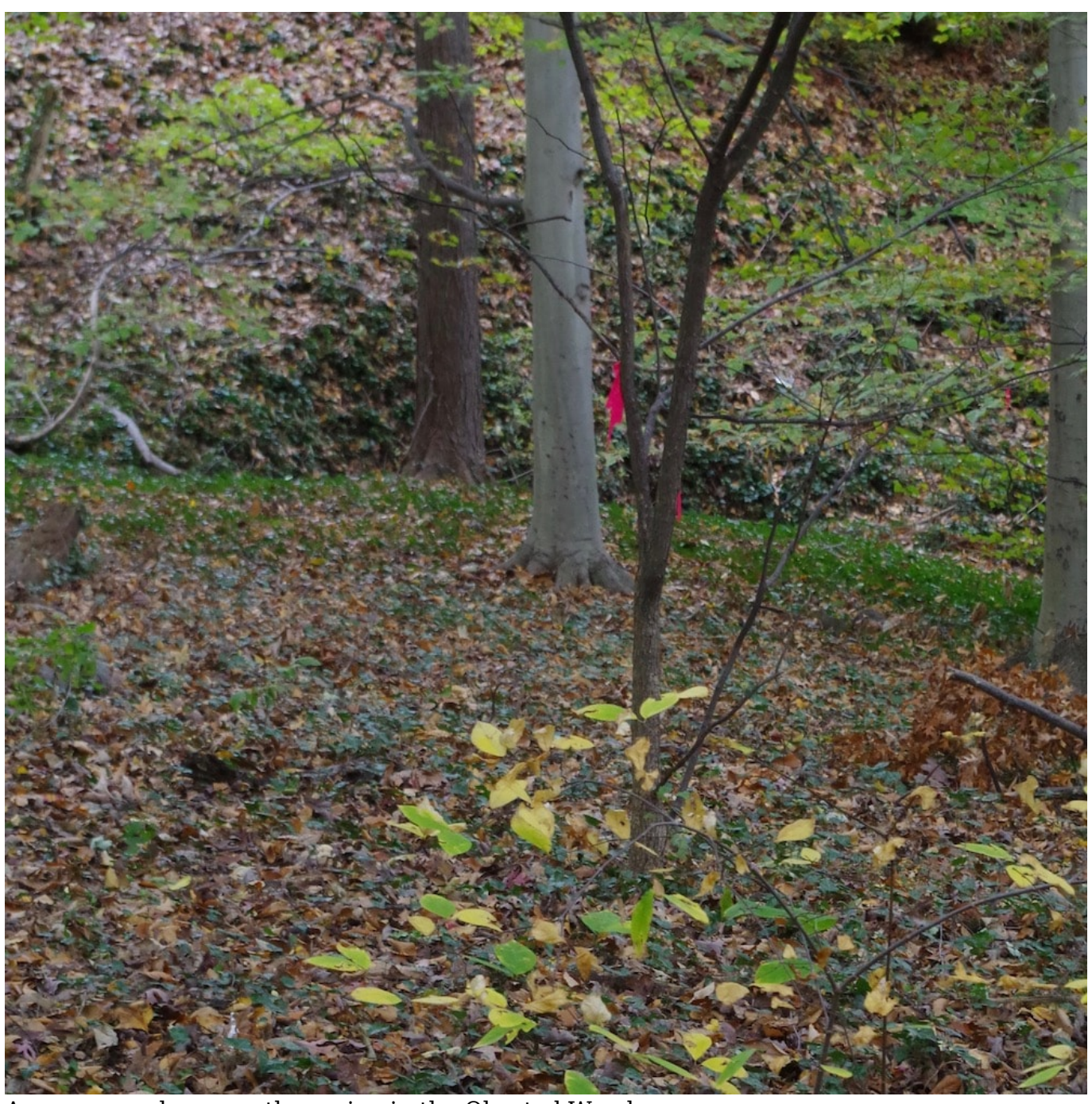
A survey marker near the ravine in the Olmsted Woods

This current topographical survey will be followed by a tree survey, identifying and assessing tree conditions and including a plan for long-term care of the trees. We expect to upgrade our water control devices and adopt systems for tracking water flow.