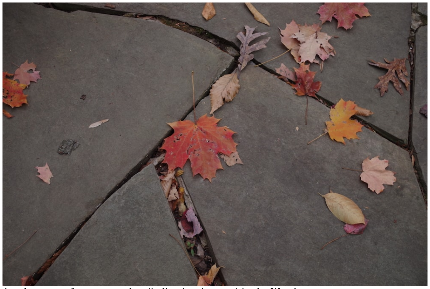
Another type of orange marker (indicating Autumn) in the Woods