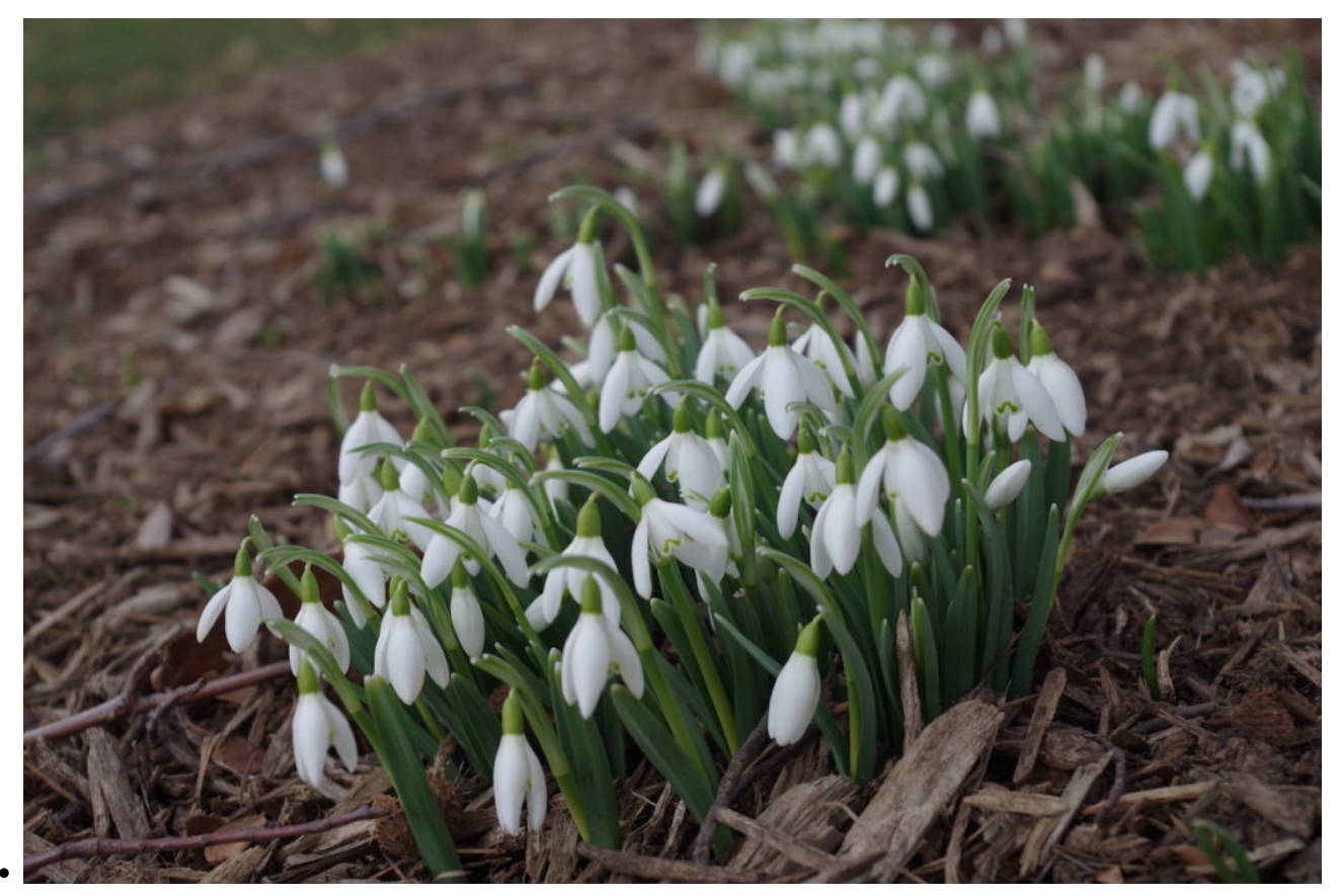
Snowdrops near the Cathedral Apse