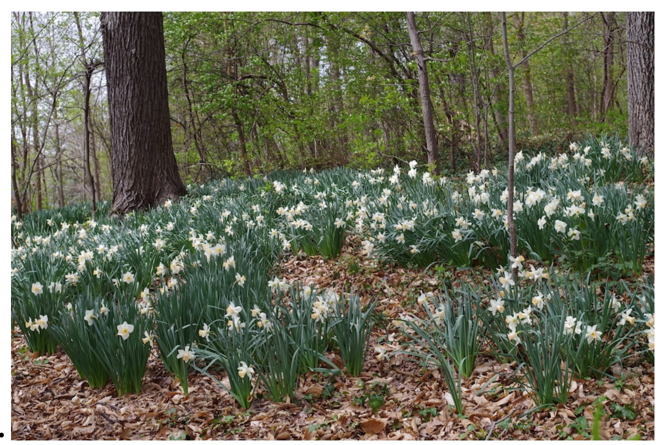
Daffodils in the Olmsted Woods