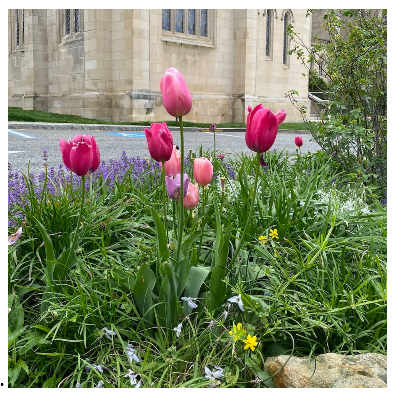
Tulips near the Cafe