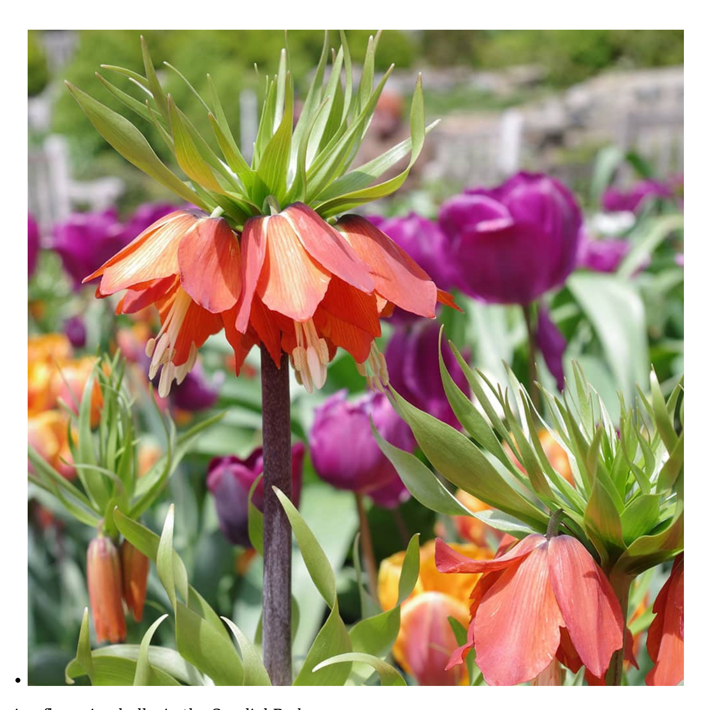
Spring flowering bulbs in the Sundial Bed