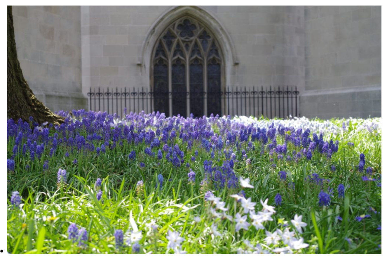
Grape Hyacinth near the Cathedral Apse