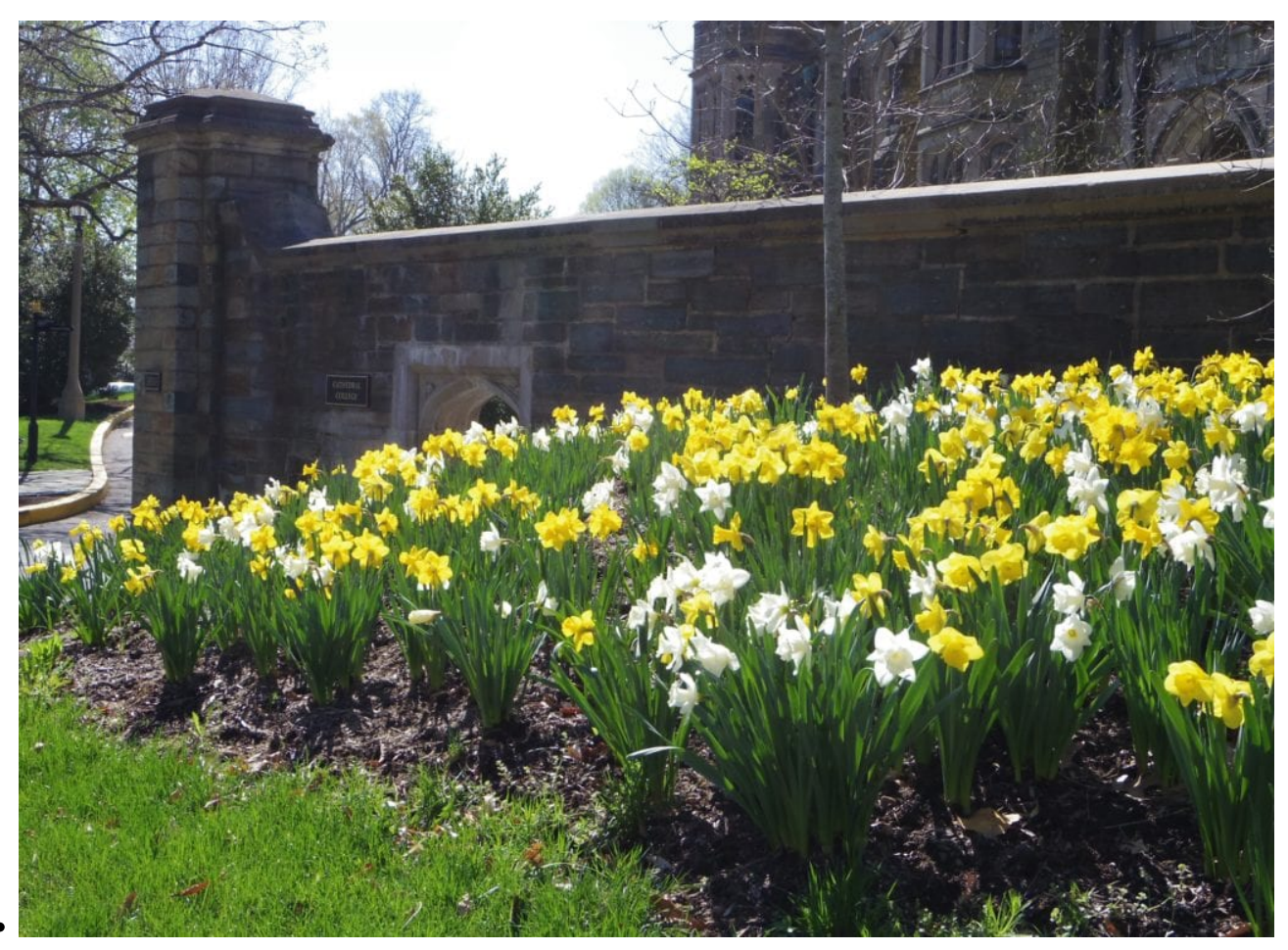
Daffodils along Woodley Road near the Cathedral College