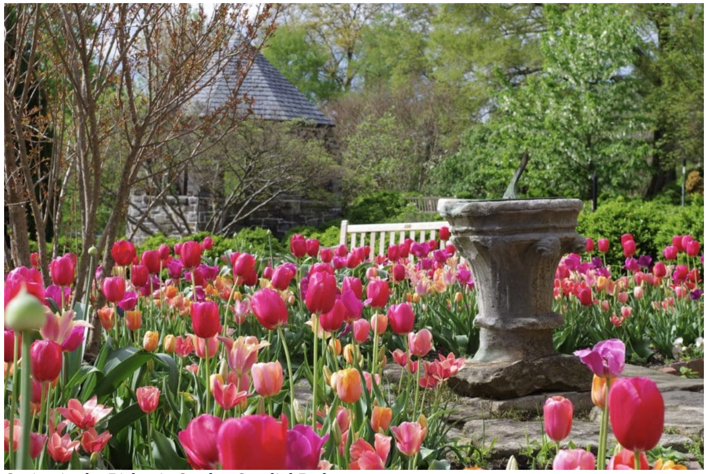
Spring in the Bishop's Garden Sundial Bed