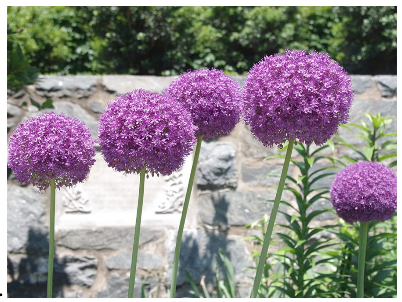
Allium in the Upper Perennial Border