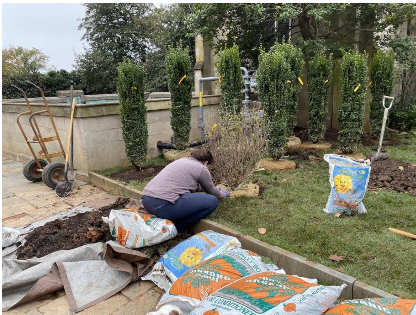
Plantings were installed to conceal the gas piping