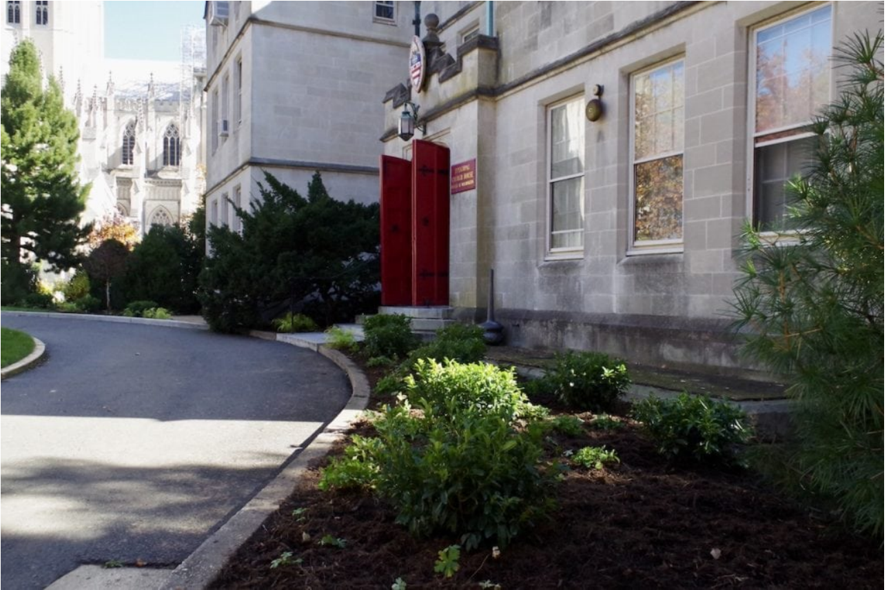
New plantings in front of Church House

All Hallows Guild has coordinated with the Cathedral in the repair and renovation of the front garden at Church House. Part of the area of the garden and lawn was excavated and destroyed to install new gas lines. Destruction can always be an opportunity, and our horticulturists have consulted with the Garden Committee to create a new design for the front garden, for which the Guild contributed funds.