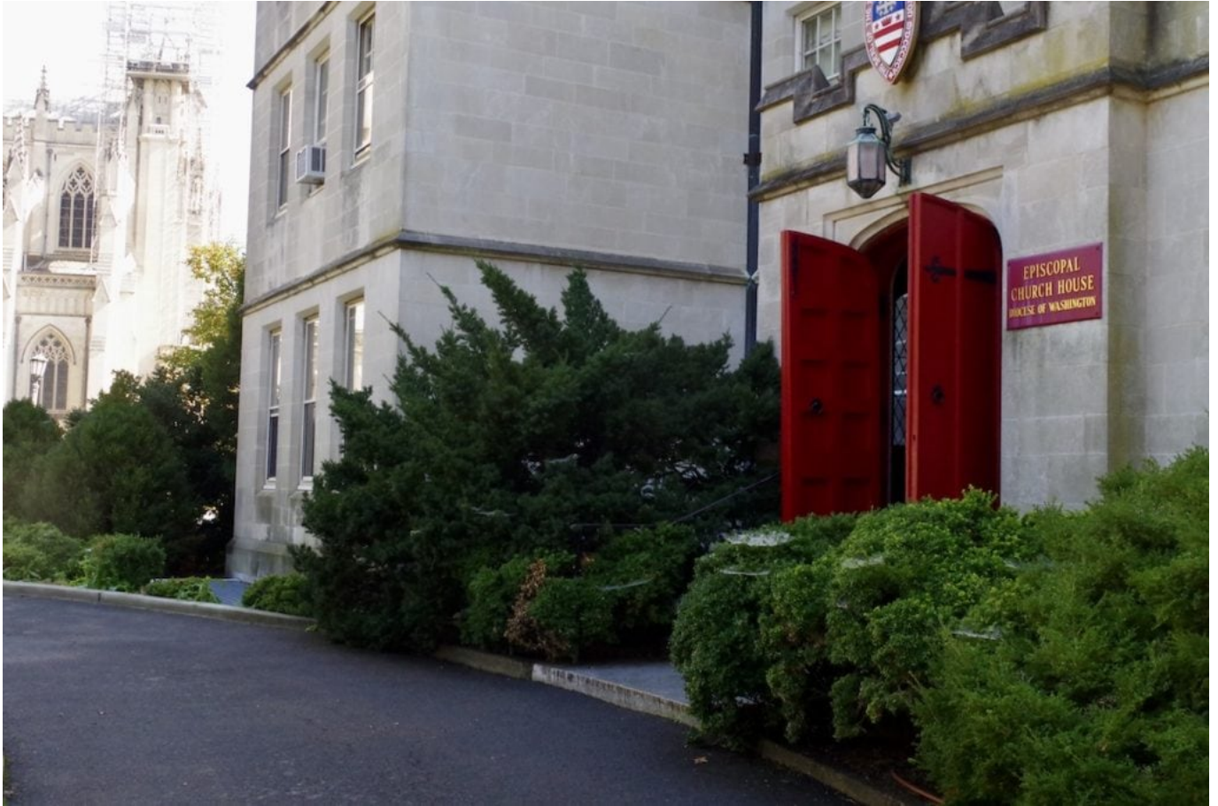
Before: Large shrubs crowded the entrance to Church House

The entire front garden, including the area adjacent to the cafe patio, has been replanted. This area, which borders South Road, is seen by visitors entering the Cathedral grounds from Wisconsin Avenue. New sod, shrubs, trees, and perennials were installed.