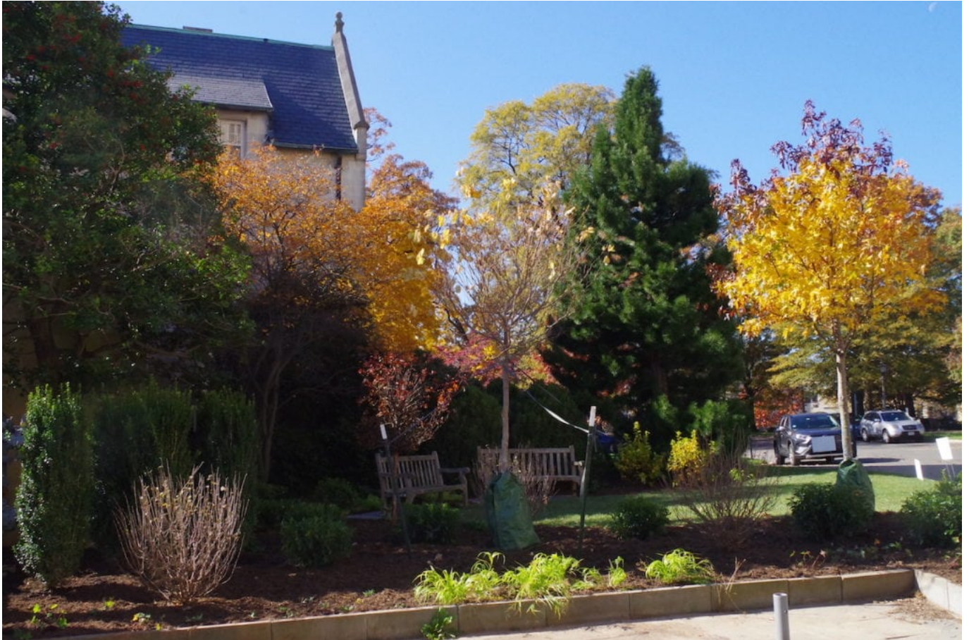
Fall colors in the newly planted Church House garden

Church house was originally the residence of the Bishop. It is now the headquarters of the Episcopal Diocese of Washington and includes offices for the Bishop and staff.