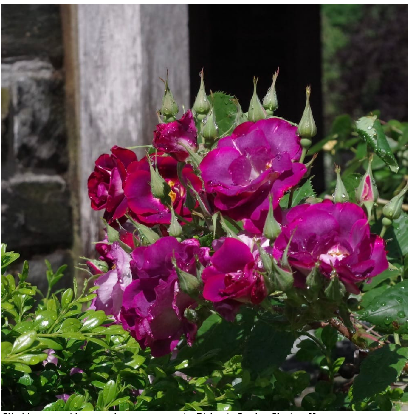
Climbing roses bloom at the entrance to the Bishop's Garden Shadow House