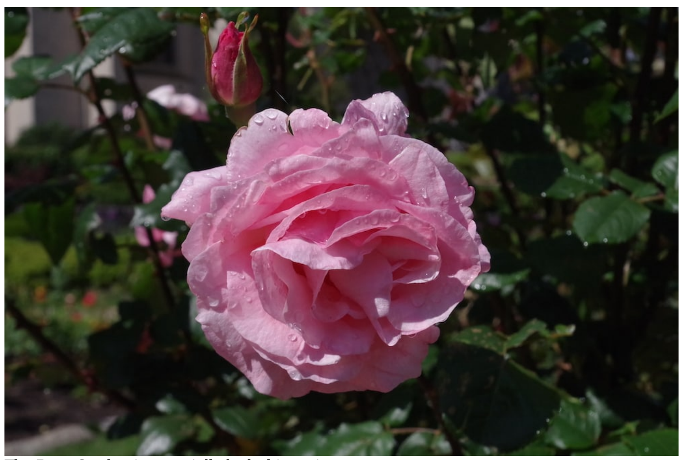
The Rose Garden is especially lush this spring