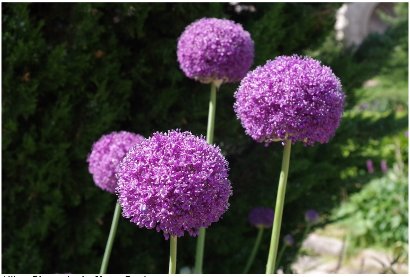
Allium Blooms in the Upper Border

As Grounds staff increase their hours, they are gradually catching up with necessary garden maintenance; however, they find it difficult to work efficiently and safely due to the increasing volume of visitors, especially in the Bishop's Garden. Preserving distance while maneuvering wheelbarrows in the Bishop's Garden narrow paths is hampered by visitors sitting on the benches beside the paths and the beds requiring maintenance. Increasing numbers of people in the garden making social distancing while working nearly impossible.