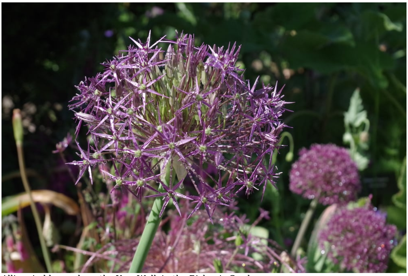
Allium in bloom along the Yew Walk in the Bishop's Garden