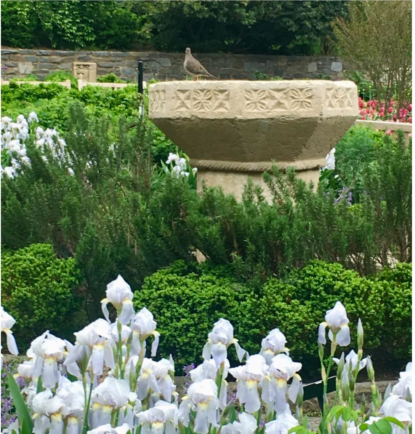
Bas relief behind the Pool of St. Catherine and the Carolingian Font

The conservation work done in October 2018 included five granite bas relief panels and the Carolingian Baptismal Font. McKay Lodge assessed the condition of the reliefs as fair to