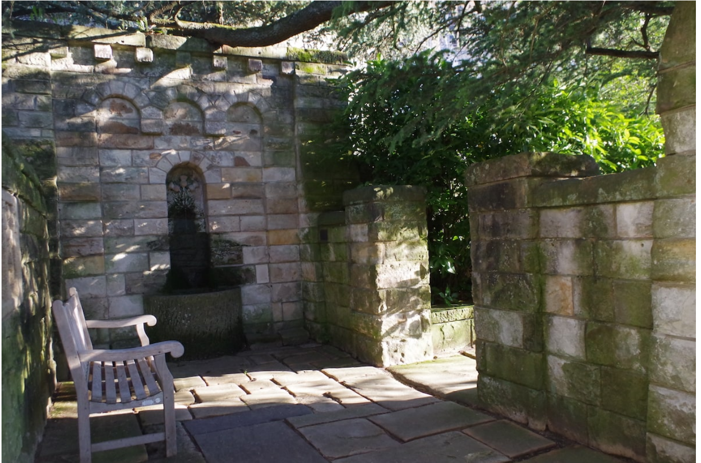
The Norman Arch and Court prior to conservation work