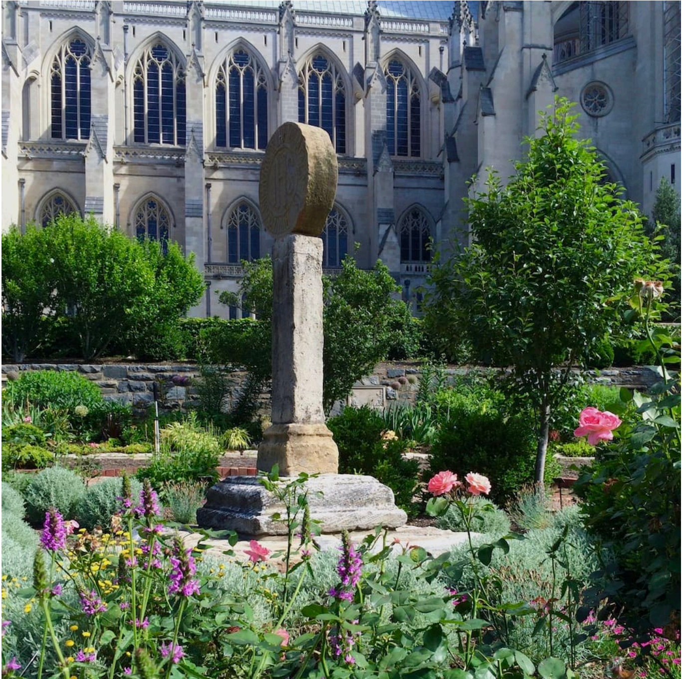
The Wayside Cross in 2020