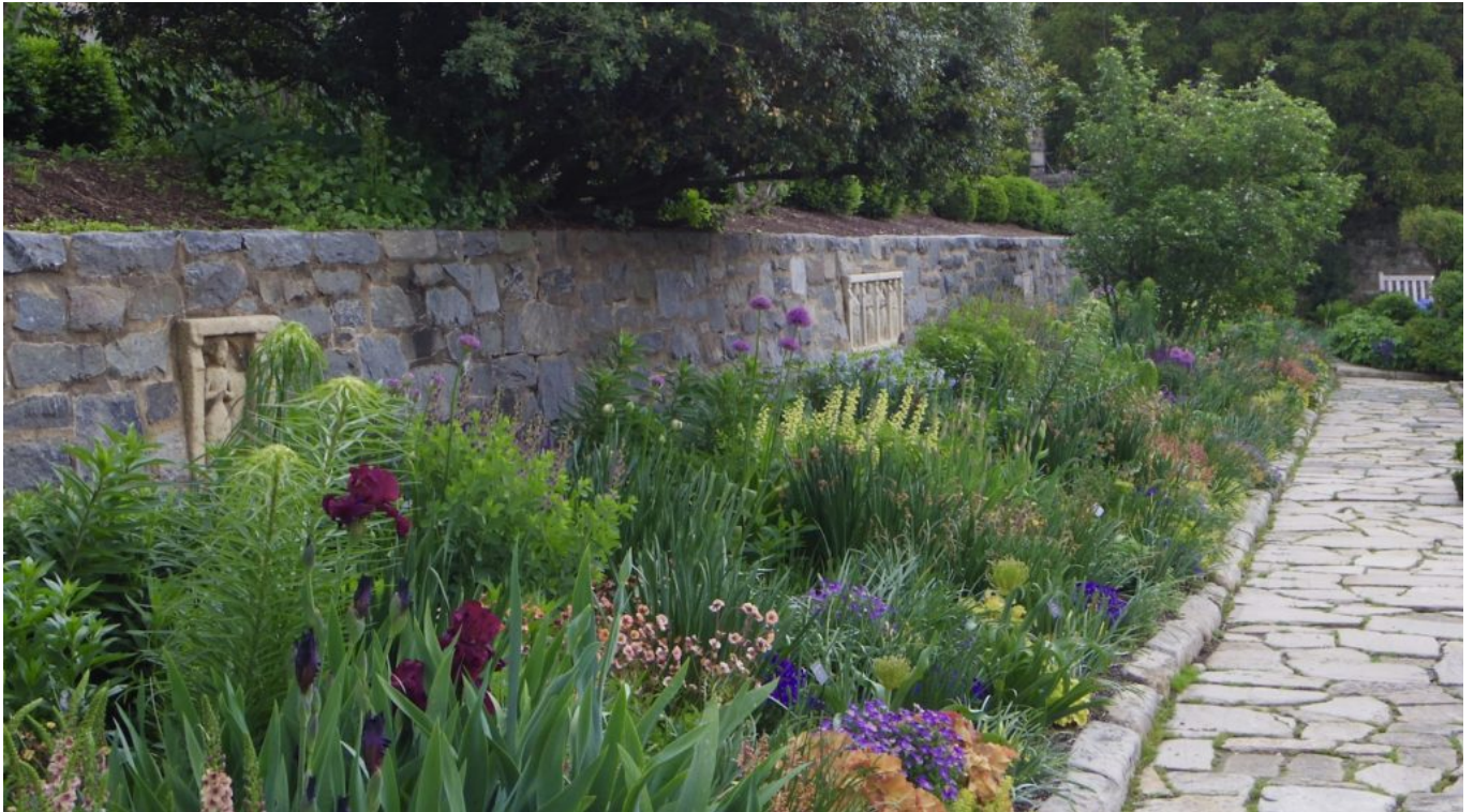
Bas relief panels in the upper wall of the Bishop's Garden

The design of the Bishop's Garden incorporates plants of historical interest and plants of the Bible and Christian legends.