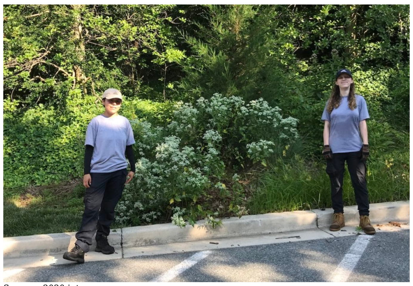
Summer 2020 interns