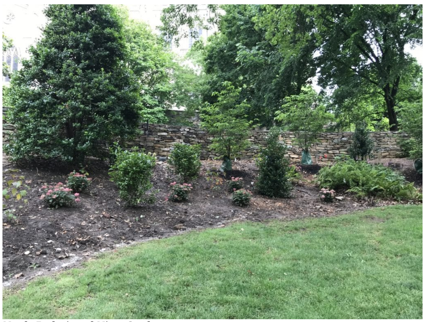
Newly Redesigned Nitze Garden