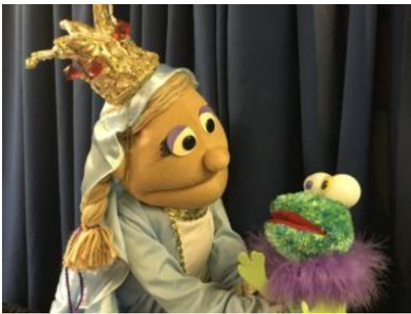
Puppets from The Frog Prince