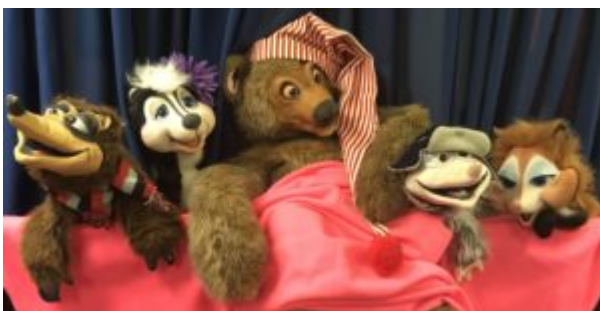
Some of the cast for this years Flower Mart puppet show - Animal Tales