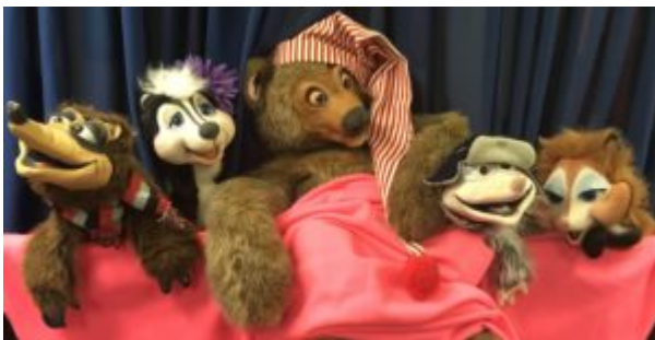
Some of the cast for this years Flower Mart puppet show - Animal Tales