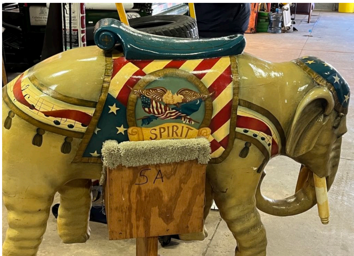
Spirit the Elephant

If you would like to contribute to our Carousel Restoration Fund, you may do so by clicking on the link below.