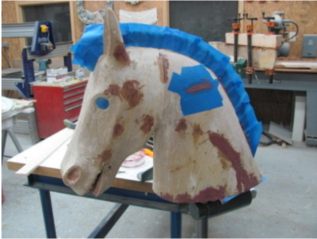
Coco the Zebra mid-restoration