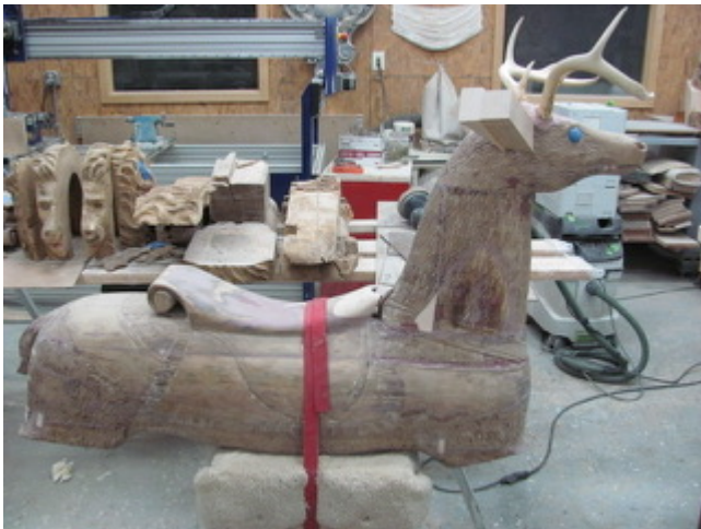
Blackberry the Deer undergoing restoration

The restorers took photographs of all the animals prior to beginning the work to ensure the original paint and trim selected by the original “adopters” of the animals will be restored. To date, the Zebra and Blackberry, the deer, have been restored and returned to the Close. The lion and a horse are almost repaired and may be back in time for Flower Mart 2023. Carousels and Carvings recently carried the Elephant and one of the Horses to Ohio for repair. Grants and donations help defray the cost as repairing one of the animals is approximately $6,000 - 8,000. The Guild is preserving an important part of American history as well as continuing to delight Washington DC families when the carousel appears on the Cathedral lawns every Spring. Only 16 animals to go!