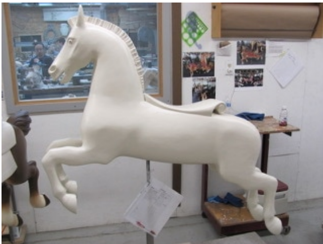
Coco with first coat of paint