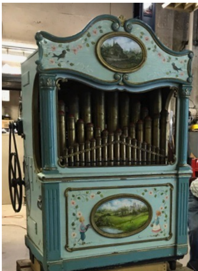
Caliola case prior to restoration