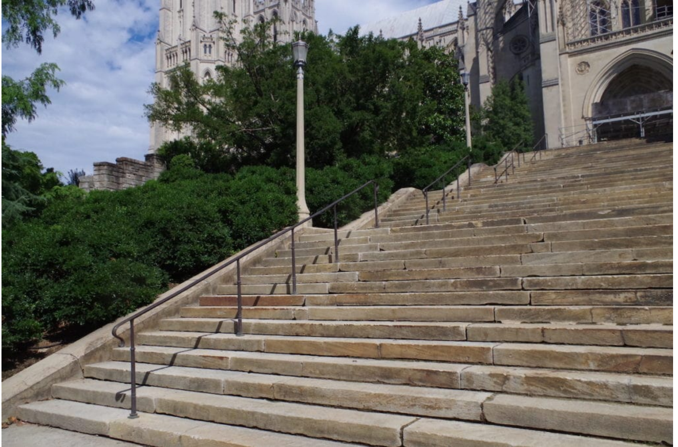
The Pilgrim Steps are a major feature on the south side of the Cathedral and were designed by Florence Bratenahl of Aquia sandstone