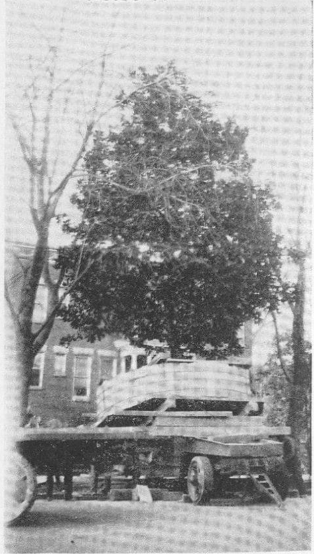
MAGNOLIA ON ITS TRAILER

One of the mature specimens moved to the Cathedral Close was a 35 foot tall magnolia tree.