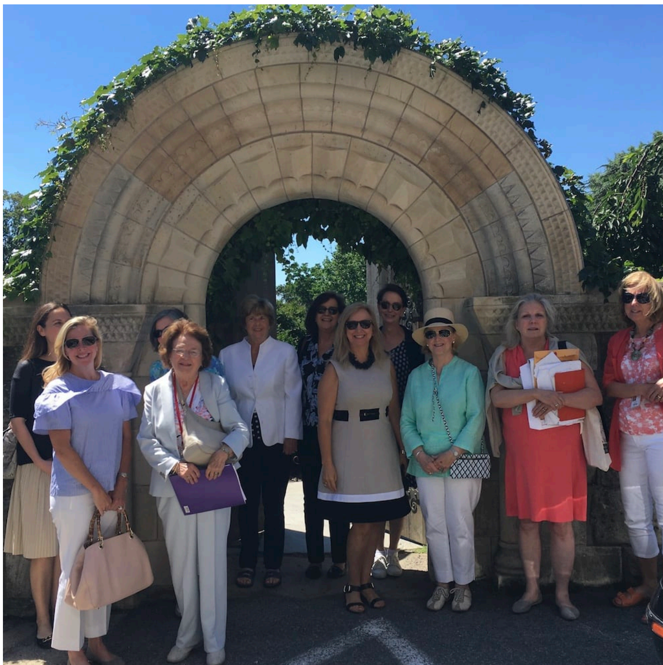
All Hallows Guild Board Members at the Bishop's Garden Norman Arch Gate