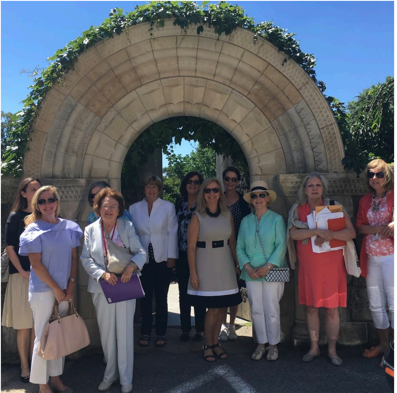
All Hallows Guild Board Members at the Bishop's Garden Norman Arch Gate