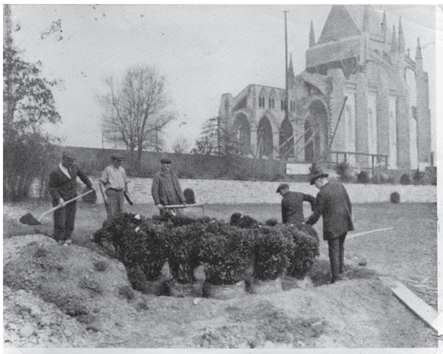
Planting of boxwood in Bishop's Garden around 1925.

All Hallows Guild—Helping to ensure the care, preservation, and beautification of the gardens, grounds and woodlands of Washington National Cathedral for more than 90 years.