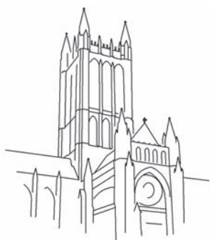
— WASHINGTON — NATIONAL CATHEDRAL

We are committed to restoring or replacing the damaged shrubs, trees and pools and we will return these sacred spaces to their former serenity and splendor. Gardens change and plants grow, and holes and empty spaces will be filled in and perhaps made even more marvelous.