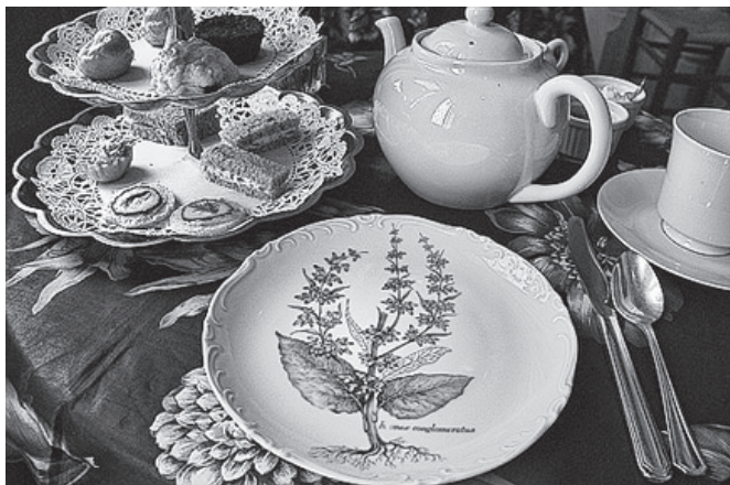
Tea Guests Enjoy a Catered Tea Following a Cathedral Guided Tour

The Tour and Tea, a joint program with Cathedral Visitor Programs, continues to be successful. During the past year we have welcomed 2,923 guests from all parts of the country and abroad. This number however is a decrease from previous years due to necessary weather cancellations. Eighty-one teas were held during the year.