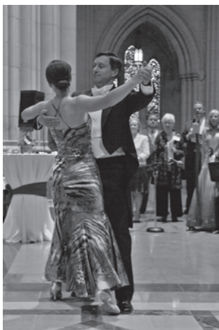
Waltzing at the Preview Party