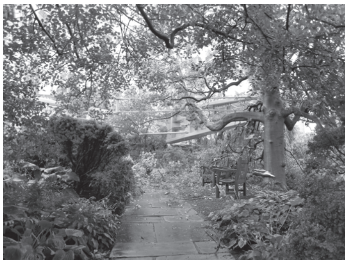
Photo taken by Joe Luebke shows a fallen crane resting on the Bishop's Garden wall—damaging the wall, the Norman Arch, trees and plantings and the Herb Cottage.

Occasionally, the AHG Garden Committee will employ an outside contractor for a special project.