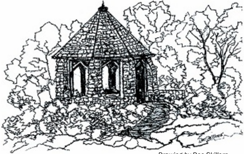
Drawing by Dee Skillern