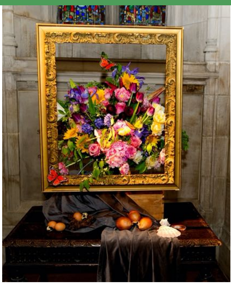
The Embassy of Royal Netherlands provided this stunning floral exhibit at this year's highly successful 75th annual Flower Mart.

To become a member or to make a contribution, call (202) 537-2937 or visit www.allhallowsguild.org