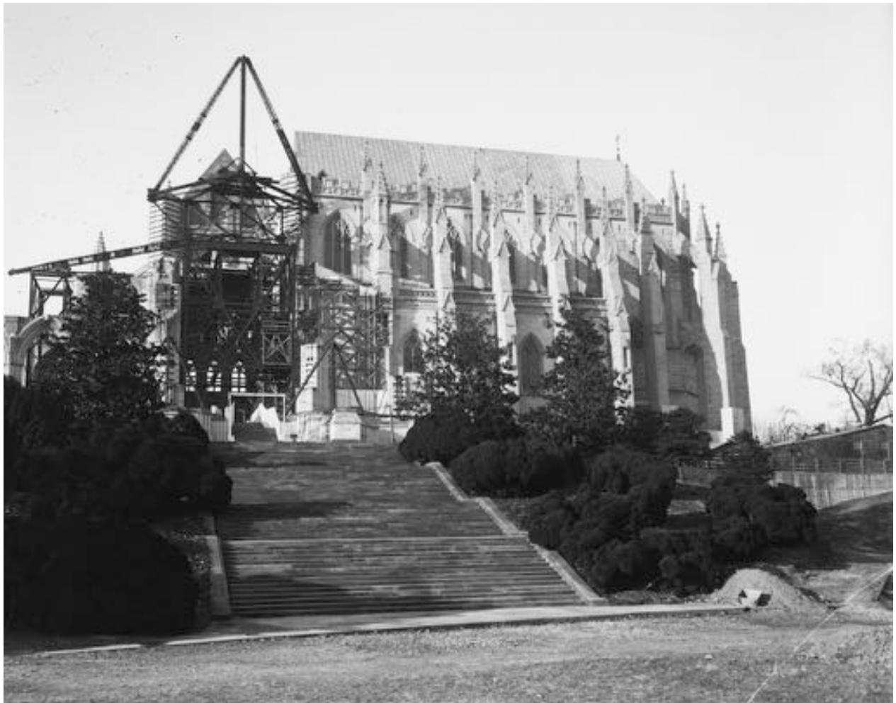
Early view of the Pilgrim Steps with the Cathedral apse - the North transept under construction