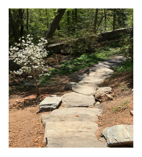
All Hallow Guild - May 9, 2018 page 1